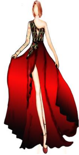
Design No. (21)