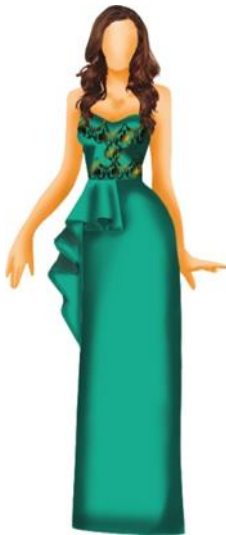
Design No. (22)