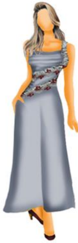
Design No. (19)