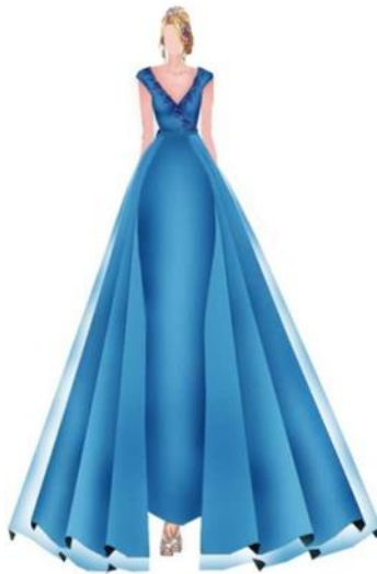
Design No. (17)