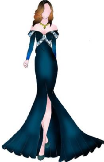
Design No. (10)