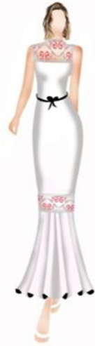
Design No. (15)

https://www.vectorian.net/pack-art-nouveau.html