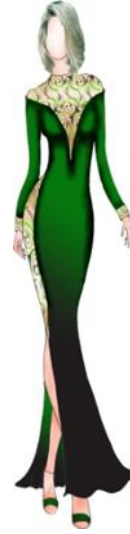
Design No. (9)