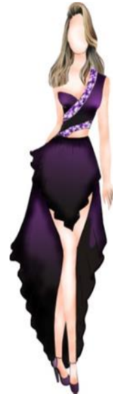
Design No. (18)