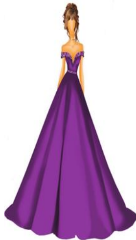
Design No. (23)