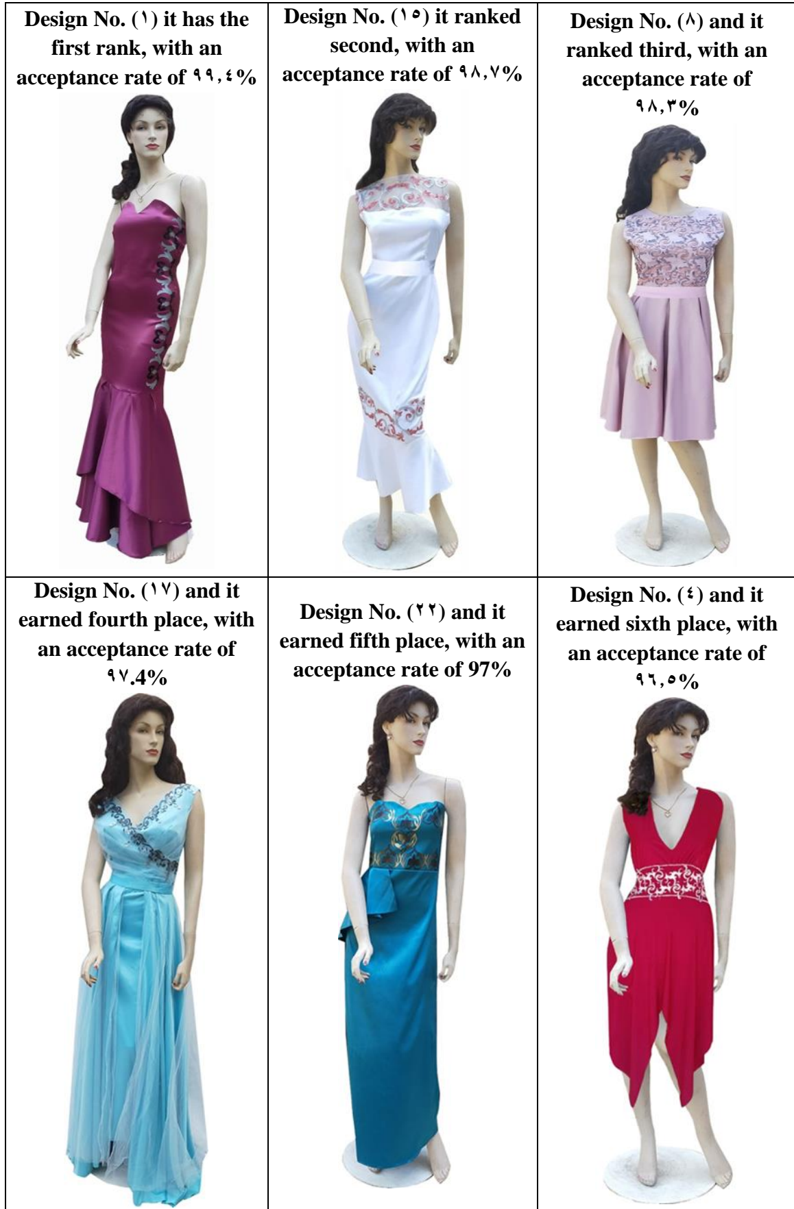
Table No. (٢) Implemented designs