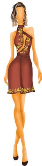
Design No. (24)

https://www.vectorian.net/pack-art-nouveau.html