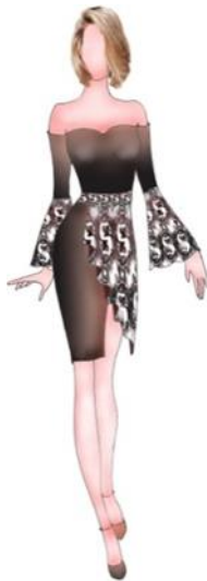
Design No. (16)