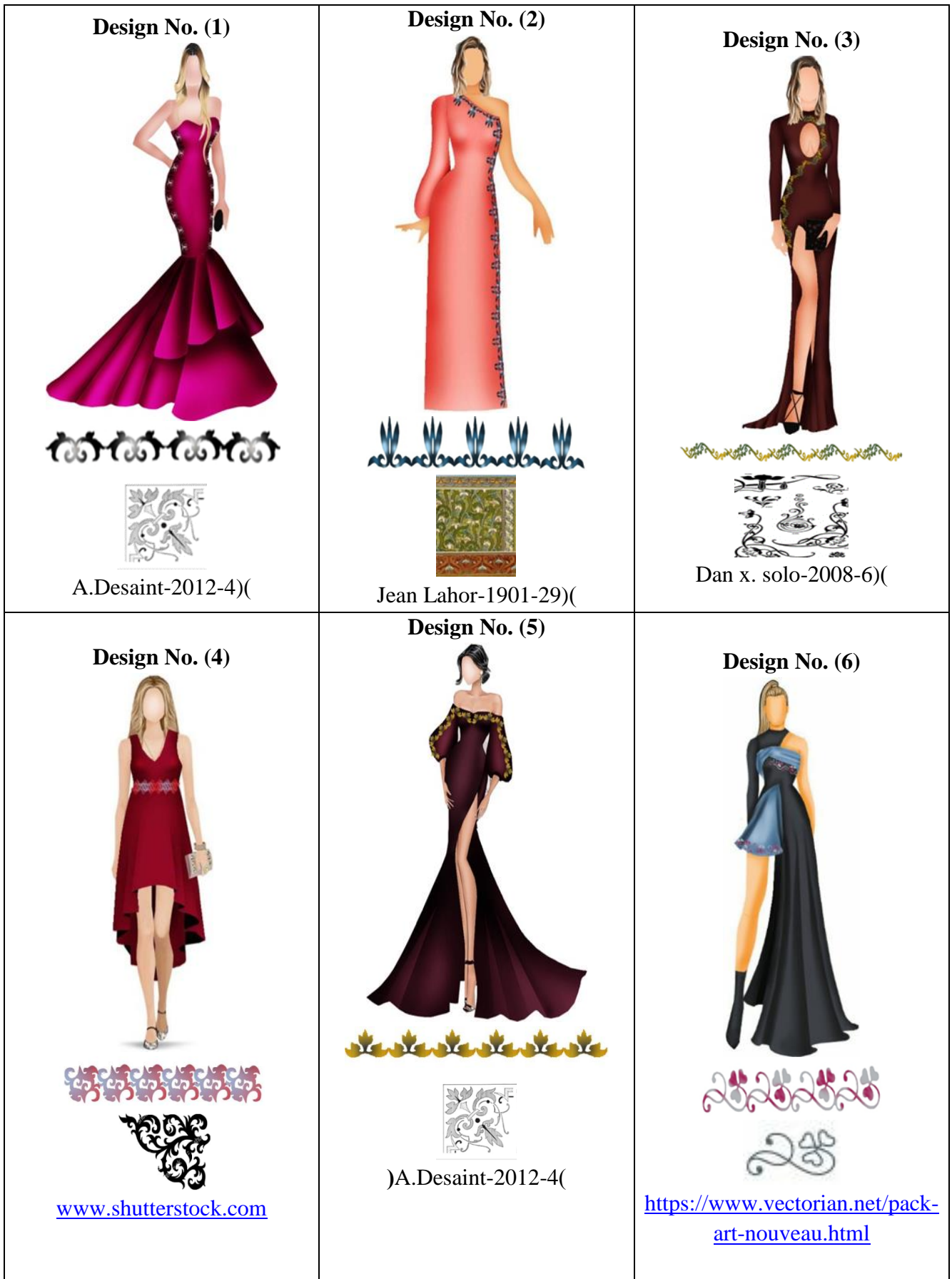
Table No. (١) Suggested designs