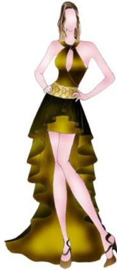
Design No. (20)

https://www.vectorian.net/pack-art-nouveau.html