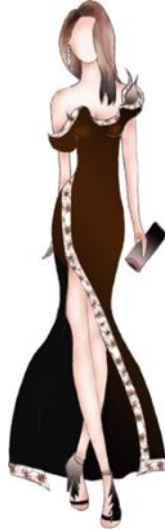
Design No. (11)