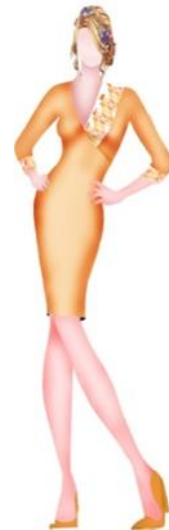
Design No. (12)