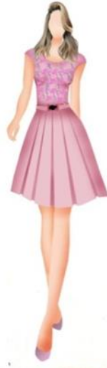
Design No. (8)