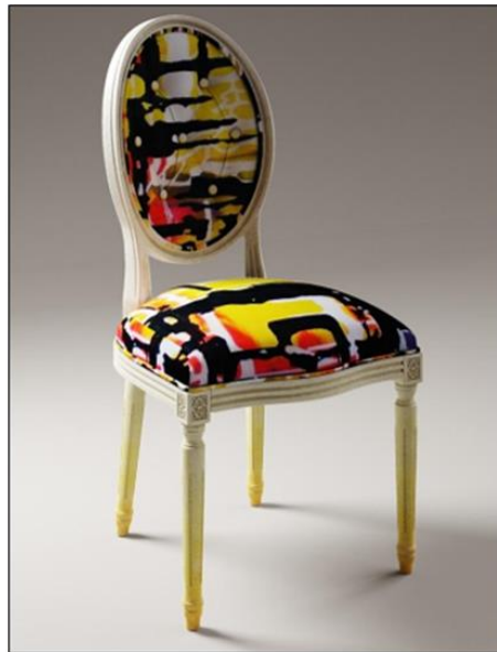
Fig. 1 The perspective and description of the first eclectic design: Classic dining chair (Louis XVI) with printed upholstery fabric (Designed by the authors).