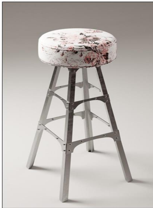
Fig. 3 The perspective and description of the second eclectic design: Modern bar chair with printed upholstery fabric (Designed by the authors).