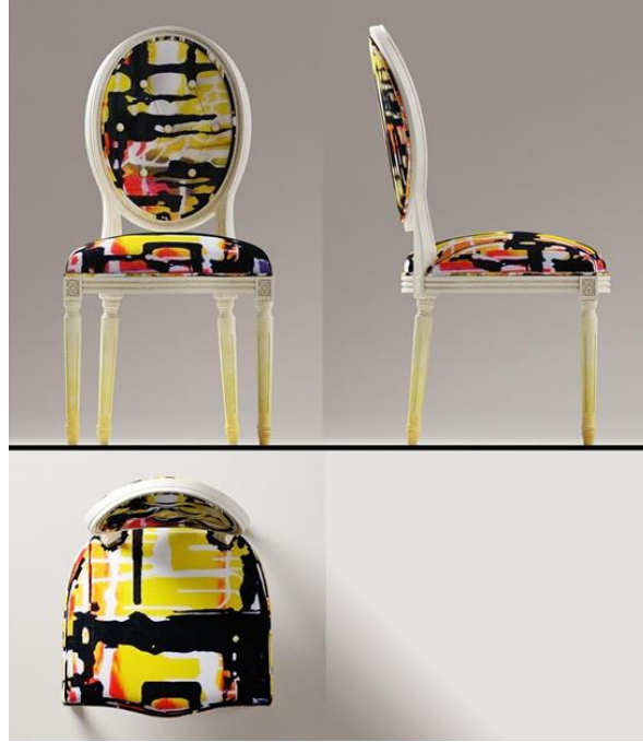
Fig. 2 Plan, elevation and side view of the first eclectic design (scale 1:15) (Designed by the authors).