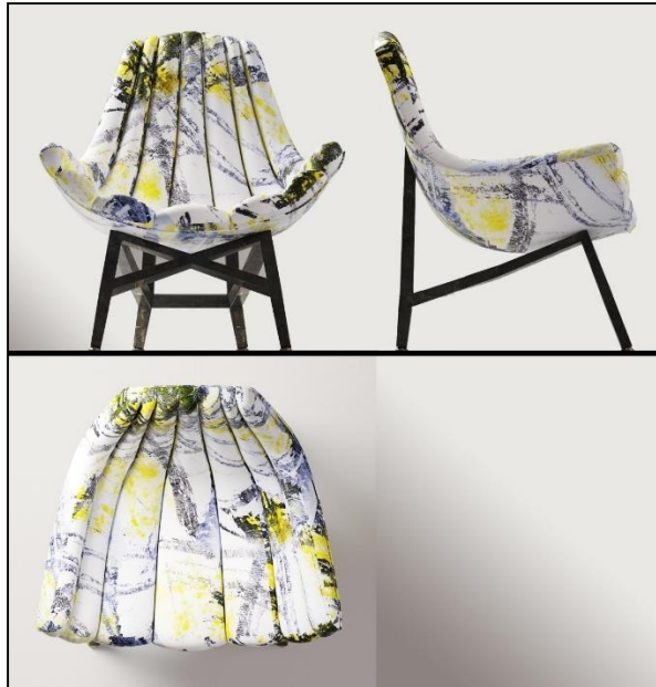
Fig. 6 Plan, elevation and side view of the third eclectic design (scale 1:15).