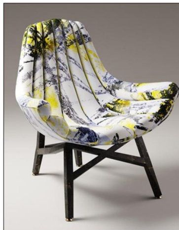
Fig. 5 The perspective and description of the third eclectic design: Rest chair (Art deco & Bauhaus style) with printed upholstery fabric (De stijl style).