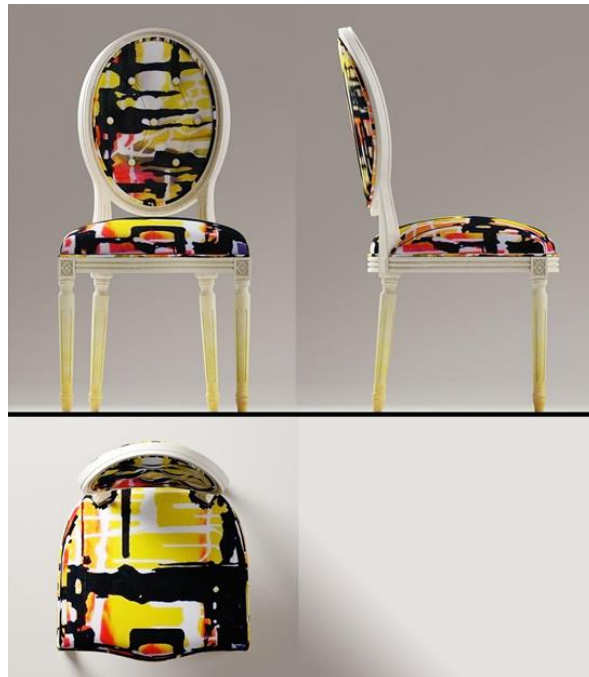
Fig. 2 Plan, elevation and side view of the first eclectic design (scale 1:15) (Designed by the authors).