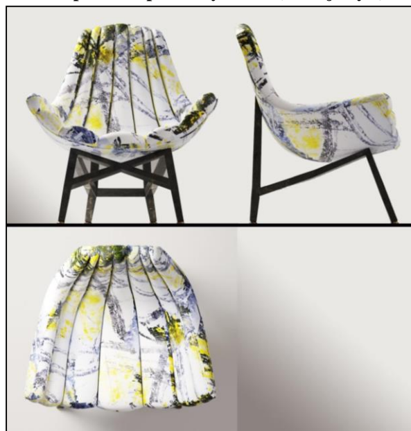
Fig. 6 Plan, elevation and side view of the third eclectic design (scale 1:15).