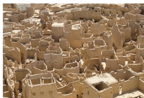
3D view for Shali