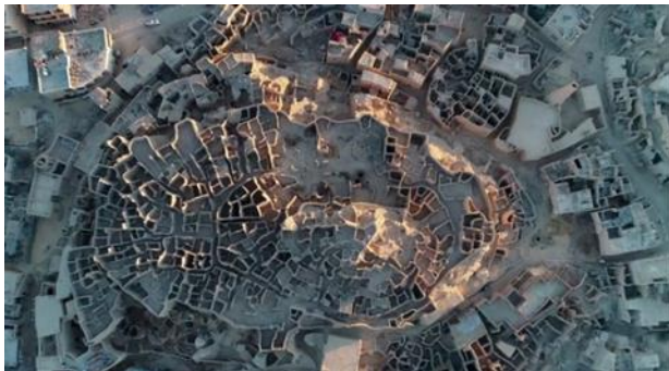
Shali village layout

The urban fabric of Shali appears as the oldest part of Siwa oasis. The village was built on a high hill as a single building of a fortified castle with no openings or passages except for one passage. The old city’s windows are small triangular openings, and the buildings formed eight layers all over the city. The heavy rains in 1919 caused the melting of the local kerchief building material that was used in all the city’s buildings. Although there is nothing left of the ancient village of Shali, however, these ruins form an attraction point for the tourists to discover how the heritage city looks years ago. Thus, Shali village is currently being revived to preserve its urban heritage. (fig 3)