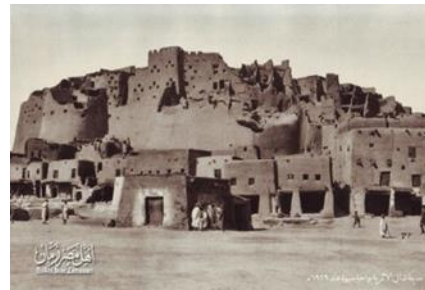
Shali village 1929