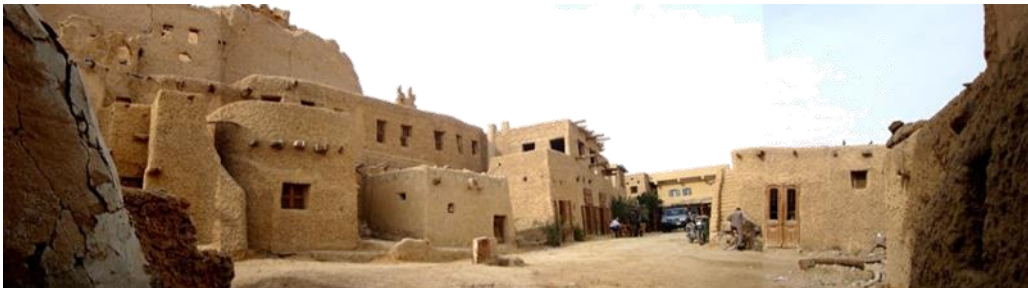
Fig 4 : preservation and reusing of old building in Shali heritage village [13]