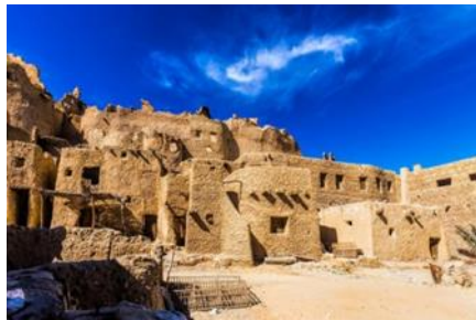
Shali village 2020

Shali heritage village is characterized by its significant cultural and urban heritage, thus the research study focused on the different features of this village. Shali is being subjected to cultural and social deterioration, in addition to the deterioration of its traditional buildings. On the other hand, Shali has a lot of archaeological and historical areas that belong to different periods. Meanwhile, the location of this city provides relative privacy and isolation from the surrounding communities. All of the previously mentioned characteristics and factors lead to a strong society within the city with a significant identity relative to the housing prototypes, costumes, accessories, tools, utilities, and the local products of the citizens. In addition, the civil society institutions and the community groups lead a significant role in the preservation of this heritage in Siwa oasis. (fig 2)