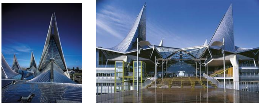
Fig.11- Antwerp Law Courts, Antwerp, Belgium. Richard Rogers 1998-2005 https://www.google.com/search?q=Antwerp+Law+Courts,+Antwerp,+Belgium.+Richard+Rogers+1998-2005