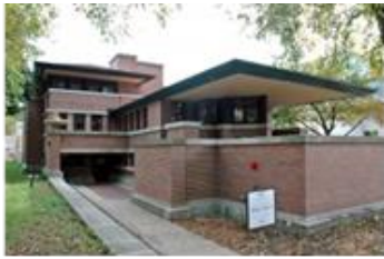
Fig.1- Robie house, Illinois Chicago, USA. frank Lloyd Wright. 1909 http://jameswoodward.wordpress.com/2008/07/03/frank-lloyd-wright/

Naturalism played a big role in forming and shaping architecture. Architecture has impacted by the Naturalism paradigm that left its impact on its philosophies, ideas and features creating a distinguish architecture movements through three specific phases. The first phase includes the period from 1900 to 1920, that is characterized by inspiring the architectural features from the living organisms like shape, structure and form (Steele.2001). In addition, the use of natural materials that linked the building to the site and surrounding environment and give it a sense of organic consistency and harmony with the surroundings (Harmony with Nature) (Pearson. 2009). We can distinguish these features in the works of Louis Sullivan, Antonio Gaudi and Frank Lloyd Wright Fig1,2,3.