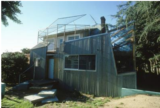
Fig.18- Gehry Residence, Los Angeles, USA. Frank Gehry, 1991-1994

https://www.google.com/search?q=Gehry+Residence,+Los+Angeles,+USA,+Frank+Gehry,+1991-1994&sxsrf=ALeKk016Os