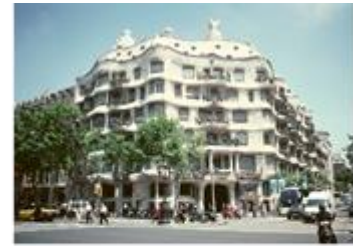
Fig.3- Casa Mila, Barcelona, Spain. Antonio Gaudi, 1910 http://www.bluffton.edu/~sullivanm/spain/barcelona/gaudimila/whole.jpg

The second phase includes the period from 1950-1970, so that architecture was influenced by the functional and structural concepts and attitude of the living organisms whether plants or animals. These concepts appeared very clear in the works of Frank Lloyd Wright and his organic theory Fig 5. In this period, architecture was influenced by the objective metaphor of the vital processes needed by the organism that provide vital energy to practice its activity and these ideas had appeared in work of Metabolism movement and others who were influenced by the natural ruling concept (Lipman. 1986).