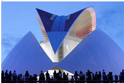
Fig.19- Opera Tenerife, Santa Cruz de Tenerife, Spain. Santiago Calatrava, 2003

Despite the great technological progress, the dominance of the scientific connotation and the increase of global environmental awareness, architecture still has an expressive value which could create an emotional response. This expressive value emerged through objective and formalistic metaphors inspired from the natural environment and the Universe. Natural environmental metaphors are inspired from biological forms (human, animal, plant) and ecological forms (mountains, rocks, rivers, Sea, etc.).