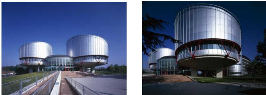
Fig.10- European Court, Strasbourg, France. Richard Rogers 1991-1994 https://www.google.com/search?q=european+court,+strasbourg,+france.+richard+rogers+1991-1994&

In addition, the rapid progress that has been witnessed by the end of the twentieth century and the beginning of the twenty-first century in all fields, especially in building technology, new materials and smart technology that dealt with the building automatically away from the interference of humans. Advanced technologies aimed at conserving the environment and providing different techniques to reduce the energy consumption. There have also been some ideas that have linked the building to the machine for example using wind turbines or solar energy to provide the energy needs of buildings and increase their ability to capture or generate their own energy.