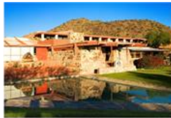
Fig.2- Taliesin west, Scottsdale, Arizona, USA Frank Lloyd Wright 1937