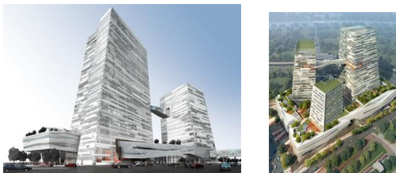
Fig.7- Chinatrust Commercial Bank, Taipei, Taiwan. Nbbj

https://www.google.com/search?q=Tjibaou+Cultural+Centre,+New+Caledonia,+Renzo+Piano1998