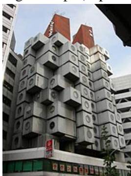
Fig.4- Nakagin Capsule Tower, Tokyo, Japan. Kisho Kurokawa. 1972 https://www.google.com/&biw=1034&bih=620#imerc=x6n5ucm9DgX4a

The second phase includes the period from 1950-1970, so that architecture was influenced by the functional and structural concepts and attitude of the living organisms whether plants or animals. These concepts appeared very clear in the works of Frank Lloyd Wright and his organic theory Fig 5. In this period, architecture was influenced by the objective metaphor of the vital processes needed by the organism that provide vital energy to practice its activity and these ideas had appeared in work of Metabolism movement and others who were influenced by the natural ruling concept (Lipman. 1986).