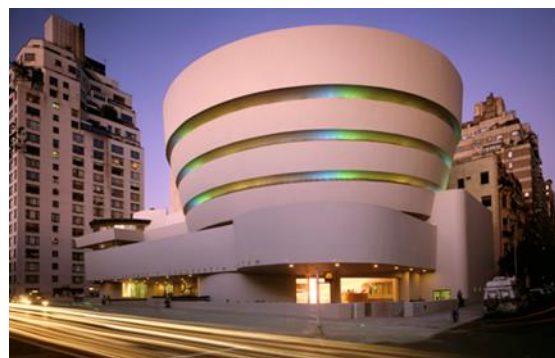
Fig.5- Guggenheim Museum, New York, USA. frank Lloyd Wright. 1956 https://www.google.com/search?q=Guggenheim+Museum,+New+York,+USA.+frank+Lloyd+Wright

The third phase includes the period from 1980 till now. Under the planetary awareness of the negative effects of the global warming and environmental pollution and the problems that