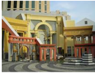
Fig.16- Piazza d'Italia, New Orleans, USA. Charles Moore, 1978

http://www.flickr.com/photos/glenhsparky/4265409930/