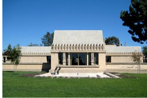
Fig.12- Hollyhock House, Los Angeles, California, USA. Frank Lloyd Wright 1919-1921

http://allanellenberger.com/tag/frank-lloyd-wright/