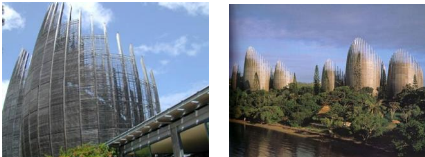
Fig.6- Tjibaou Cultural Centre, New Caledonia. Renzo Piano 1998

At this phase architects were not only inspired by the formal features of the living organism but they were also inspired by the behavior of it, focusing on plants and the way they interact with nature, using the latest technologies to provide the necessary energy for the building and to reduce the energy consumption rates. Metaphors were often limited to the outer envelope that corresponds to the natural environment. These metaphors led to the similarity of buildings with the familiar forms in nature or the universe at direct formal level. Architecture is formed objectively from the influences of natural phenomena including the flow of wind, water, earth energy and magnetic field. These metaphors have appeared in many of architects’ works who were influenced by the natural forms of plants, animals and natural elements of the universe in their designs, one of these examples is Tjibaou Cultural Centre, designed by Renzo Piano, 1998 Fig 6. These features also are shown clearly in the works of Santiago Calatrava, Richard Rogers, Renzo Piano, Nicholas Grimshaw and others.