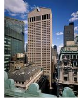
Fig.17- AT&T Building, New York, USA. Philip Johnson, 1984