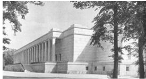
Fig.14- Haus der Kunst, Munich, Germany. Frank Paul Troost, 1937-1939

https://www.google.com/search?q=Haus+der+Kunst,+Munich,+Germany.+frank+Paul+Troost