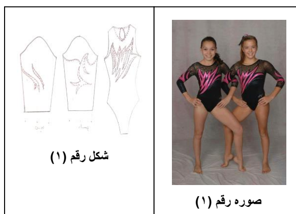
شكل رقم (١)

It is done to the melodies of music, and using some simple tools such as hoops, ribbons, wands, ropes and a ball. Picture No. (2) shows one of the designs of rhythmic gymnastics leotards.