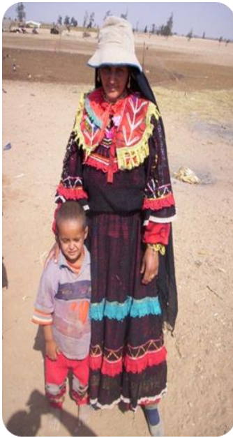
A gypsy woman dress in Sharkia governorate