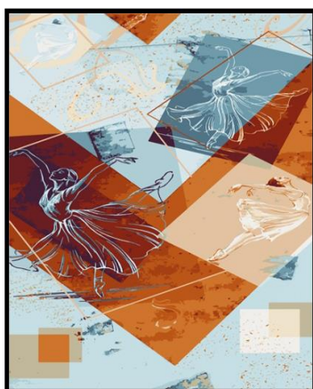
Design No. (3)