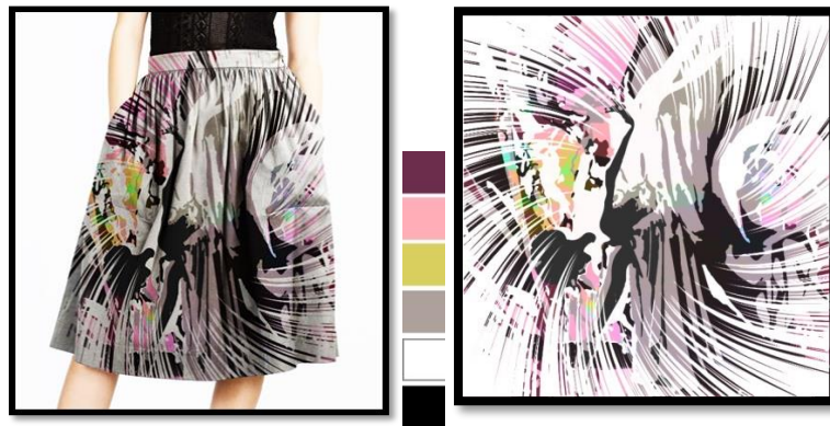
Design and Recruitment No. (5)