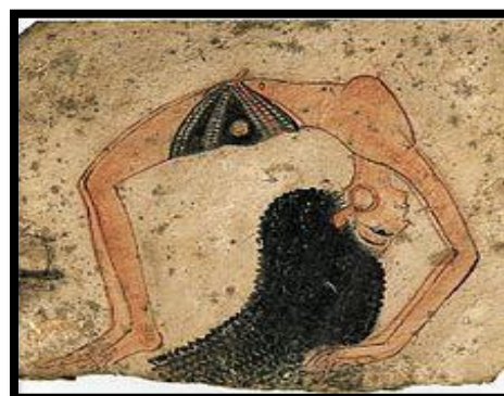
A Pharaonic dancer bows her back in a picture similar to gymnastic movements