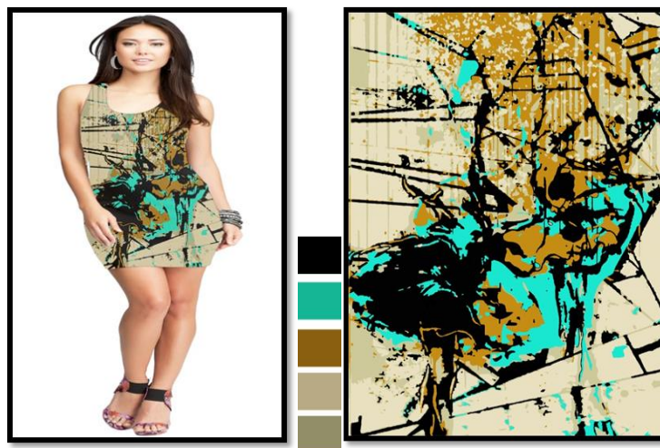
Design and Recruitment No. (6)