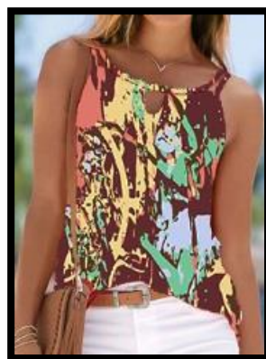
Recruitment No. (2)