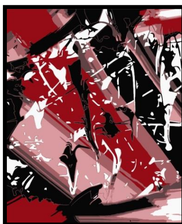
Design and Recruitment No. (4)