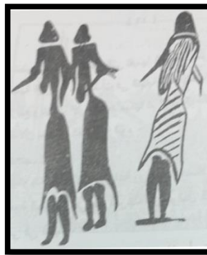
2- A dance of love and fertility