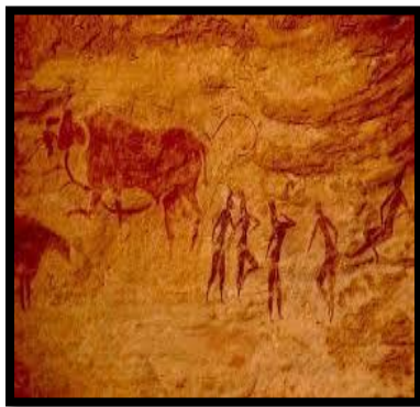
1- Hunting dance

First it was talked about the origin of the kinetic drama and mentioned the most famous dances in Neanderthal including: