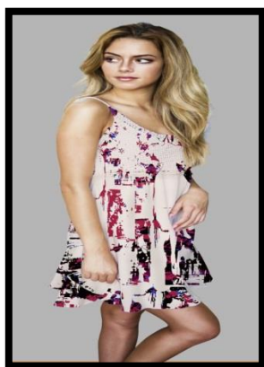
Design No. (1)