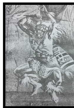
3- His dueling dance

Some pictures of dance from the ancient Egyptians are also mentioned