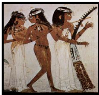
A ten-stringed harpist, next to her, A double flute player