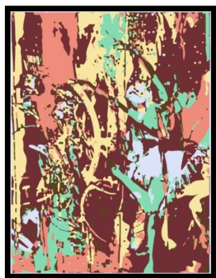
Design No. (2)