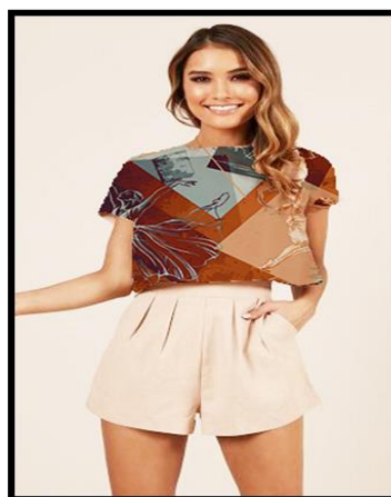
Recruitment No. (3)