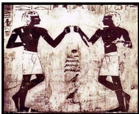
A picture that expresses the male dance and the possibility of movement compatibility