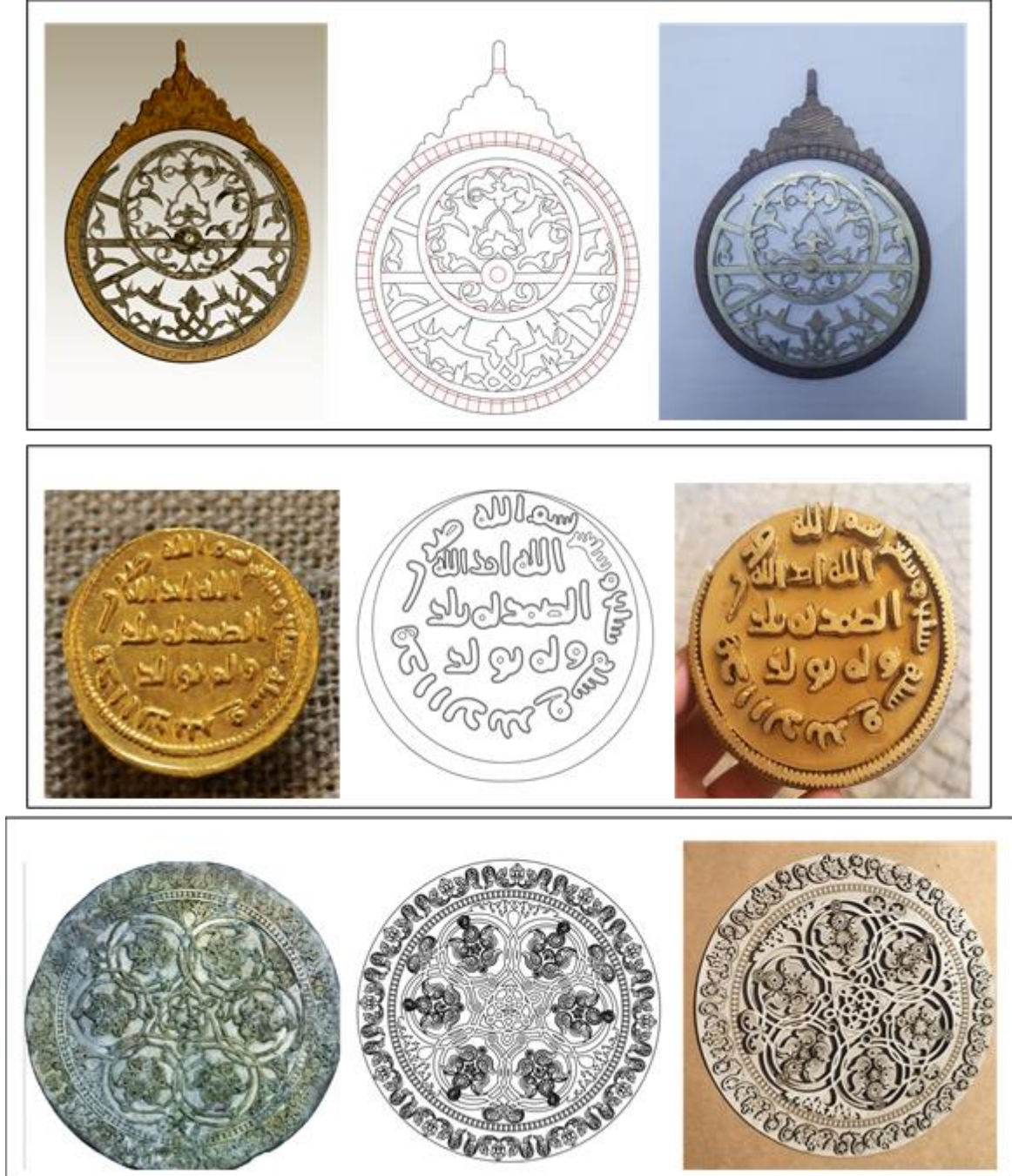
Figures (6), (7) and (8): The original artifacts (to the left side), the digital drawing (in the middle) and the applied copy (To the right side).

as the author (project supervisor) and his group of students worked as volunteers of time and effort, but materials and the cost of working in addition to transportation costs prevented the transition to the second stage, which is the production of the copies of three-dimensional artifacts.