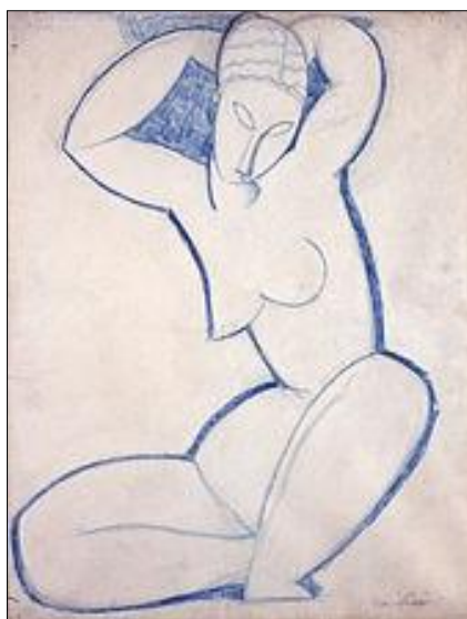
Figure (2): Artist Modigliani Caryatid, now at the New Art Gallery Walsall

At the start of the twentieth century artists like Modigliani became aware of, and inspired by African art, he was an Italian painter and sculptor who worked mainly in France. He is known for portraits and nudes in a modern style characterized by elongation of faces and figures.