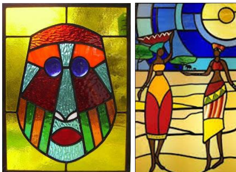
Figure (8) Stained glass - Contemporary African art