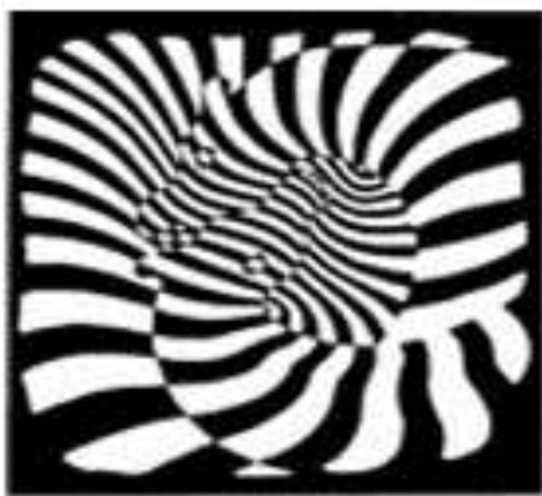
Figure (15) (Black and white Zebra) Glass panel - Reforming glass (fusing)