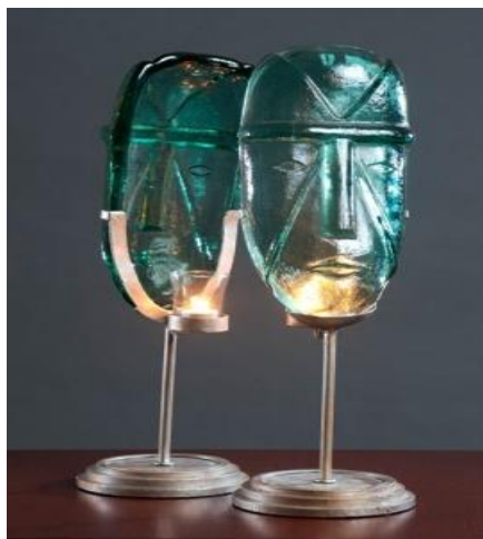
Figure (10) Glass sculpture Masks - Contemporary African art