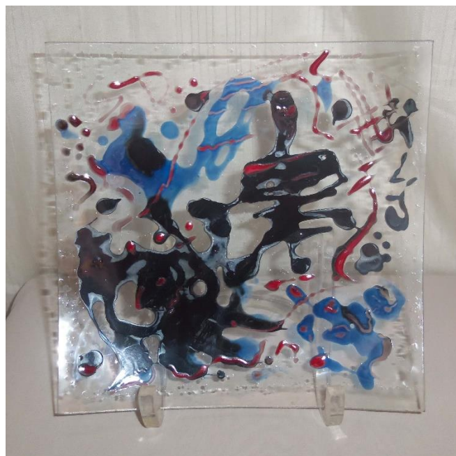
Figure (17) The African movement- glass plate –painting on glass and slumping

Based on the African art philosophy in using elements such as using human in an abstract way, it was executed by using glass painting and slumping to achieve the form of the plate.