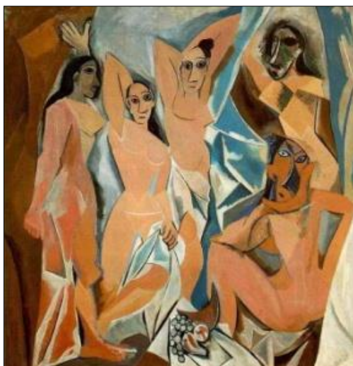
Figure (3) Picasso' painting - Les Femmes d'Alger (O. J. R. M.)