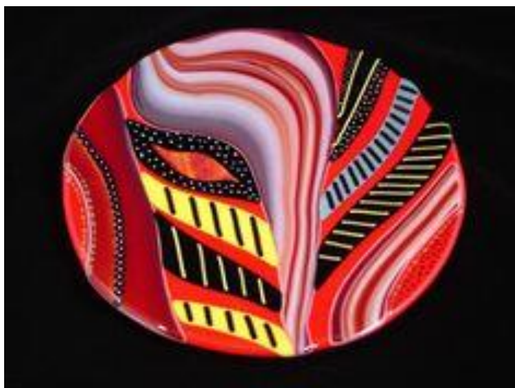
Figure (9) Glass plate- Contemporary African art