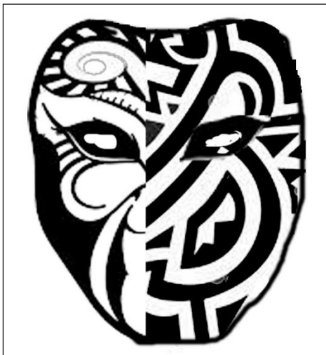
Figure (13) (Mask black and white) Glass Panel-Glass engraving