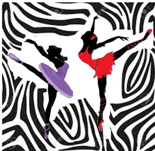
Figure (14) (Colored Ballet) Glass Panel-Glass Mosaic