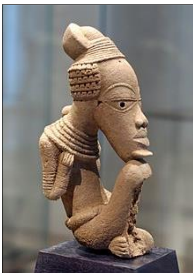
Nok Terracotta, 6th century BC–6th century CE Figure (1)

Most African sculpture was historically in wood and other natural materials that have not survived from earlier than, at most, a few centuries ago; older pottery figures can be found from a number of areas. [3] Masks are important elements in the art of many peoples, along with human figures, often highly stylized. There is a vast variety of styles, often varying within the same context of origin depending on the use of the object, but wide regional trends are apparent; sculpture is most common among "groups of settled cultivators in the areas drained by the Niger and Congo rivers " in West Africa . [4] Direct images of deities are relatively infrequent, but masks in particular are or were often made for religious ceremonies; today many are made for tourists as " airport art ". [5] African masks were an influence on European Modernist art, which was inspired by their lack of concern for naturalistic depiction. Since the late 19th century there has been an increasing amount of African art in Western collections , the finest pieces of which are now prominently displayed.