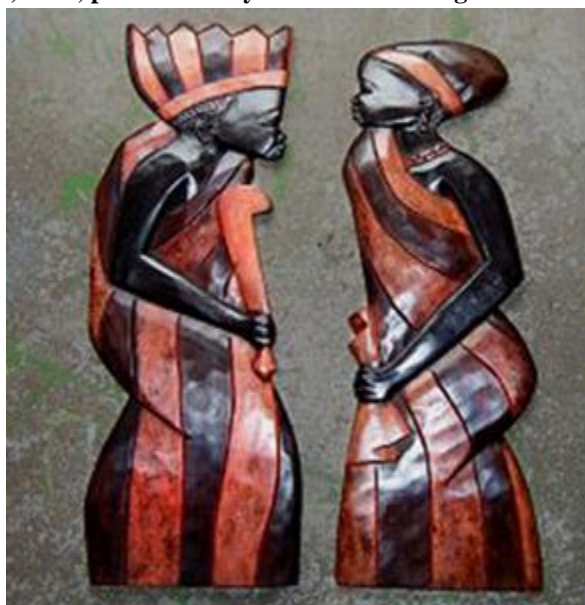
Figure (6) African wall Plaque-Chief and Queen