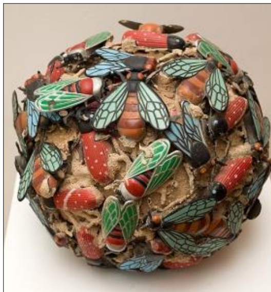
Figure (5)-Ceramic, sand, plastic and toy insects-artist Jorge Dias-2008-'Coisa'- Sculpture

There are a lot of samples of ceramic art which got involved with African art using different techniques and materials to achieve ceramics art ware , tile , sculpture , tableware and pottery.