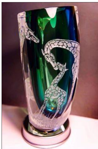
Figure (7) Seduction of Light- Crystal Vase- African Art- Giraffe