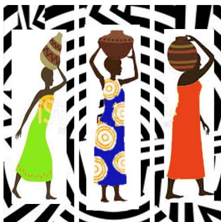
Figure (11) (Blue face) Glass Panel- painting with enamels