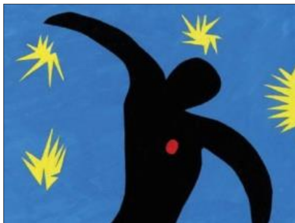
Figure (4) Matisse's painting-influence of African art

Matisse influenced by African art in its aesthetic values, especially Sculptures African art and he was interested in the arts of Northern Africa and the African primitive art and also used the expression in sensory net fees and children's arts. He used color as an essential means to express the elements in a simplified form of spontaneous childlike, Matisse has revolted against the traditions of the art schools and restrictions, and headed directly to express emotions freely using the clear and contrasting colors, in search of the properties of fine art, which overlooked the academic art.