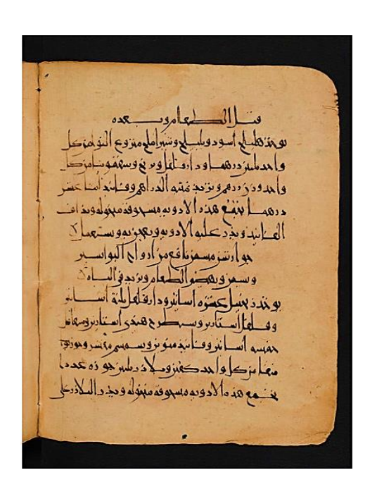
pharmacy book of Sabur Ibn-Sahl, Anfang 10. Jh. (Ms. or. oct. 1839)

In the following three examples of Arabic manuscripts from the Berlin State Library: