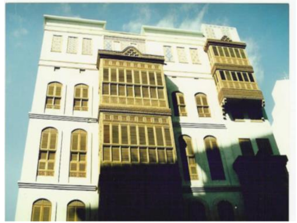
fig (1) shows the various architectural vocabularies that are represented in Mecca architecture in oriels, bows and the use of motifs.