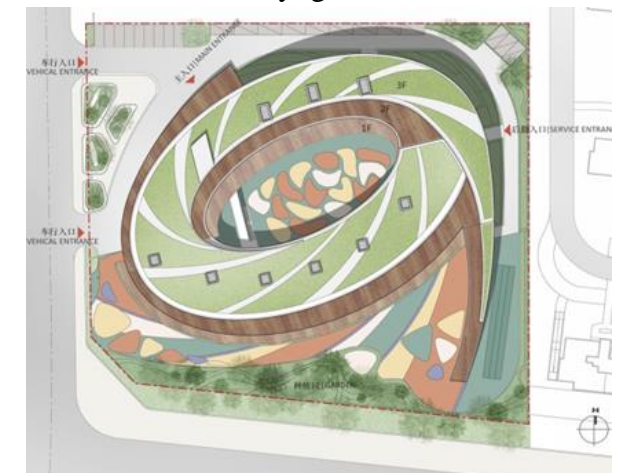
Fig (4) self-design through gardens in the kinder garden building (Xieli Garden).

They help in reducing temperature gain within the individual building and on the urban level as well, gardens reduce reflected rays on the urban environment (urban design), constructed by the group of unified design (Xieli Garden). At (shape 4) the building of the kinder garden, the building with the 3 floors was designed on the shape of elliptic ring spirally mounting to create a perfect educational environment for the kids through the direct contact with the exterior spaces and providence of natural daylight.