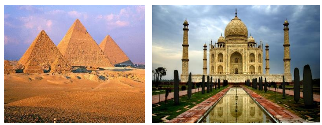
Giza Pyramids in Egypt