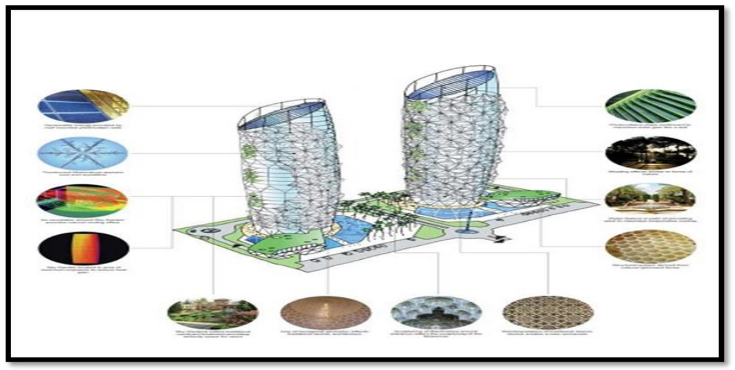
Fig (16) architectural formation and environmental design at sea towers in U.A.E.