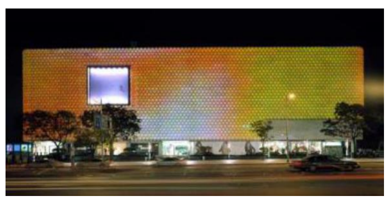
Fig (11) The use of LED. Technic in the outer interfaces of the Korean mall at Seoul city- south Korea-2003,2004. Designed by UN Studio.

One of the most important models of contemporary models that used that contemporary technology, the Korean mall interface at Seoul city- south Korea- 2003,2004. Designed by UN Studio, fig (11).