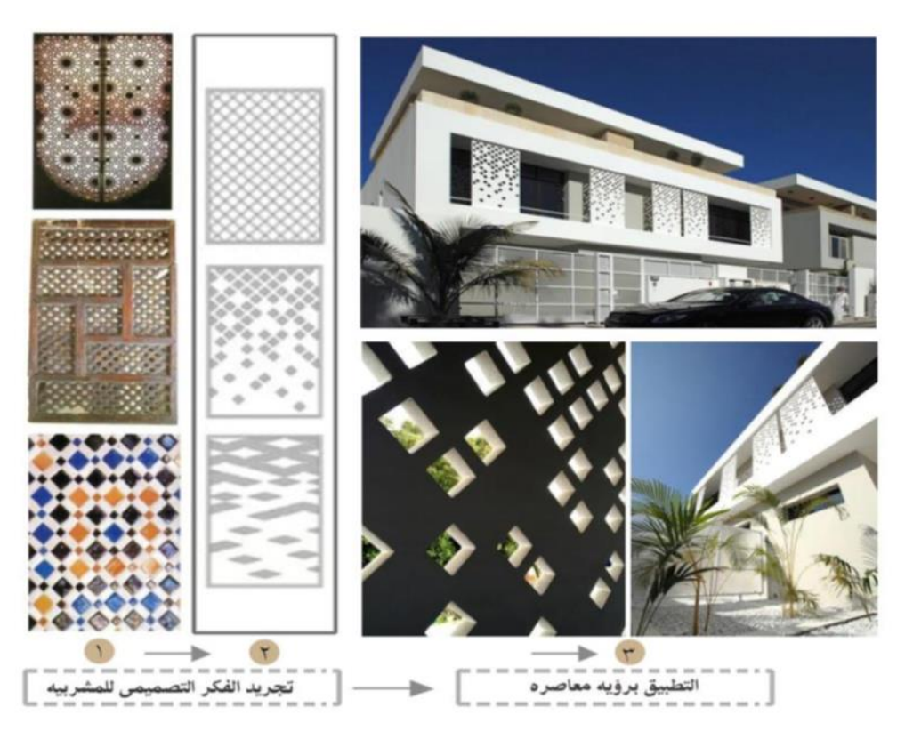
Fig (7) integration between modern technology and traditional intellect to design a bay (mashrabiya)

That include economy, architectural values and trends which represent spiritual or intellectual aspect of the shape, the shape is the sum of interaction among material, functional factors and spiritual, psychological and humanitarian factors.