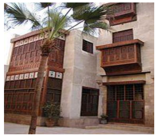
Fig (1) the use of architectural vocabularies at a residential building in Mecca.