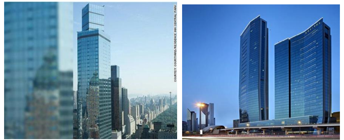
Sofitel Dubai down town hotel courtyard residence inn Central America hotel, Fig (9) comparison between factors of architectural formation for hotel buildings in both Dubai and U.S.A.

Fig (9) is a comparison between factors of architectural formation for hotel buildings in both Dubai and U.S.A. from the similarity in the building materials, the architectural formation and configuration of the general features to create the architectural masses. With the variation in climate between the both countries.