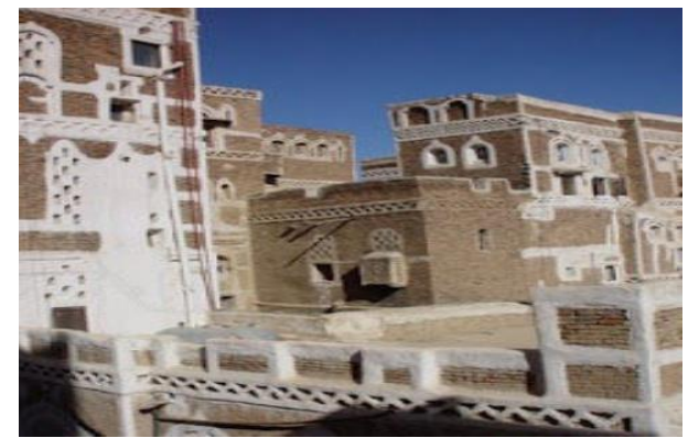
Fig (2) elements of architectural formation and motifs in the local Yemeni architecture.

fig (2) shows elements of architectural formation and motifs in local Yemeni architecture.