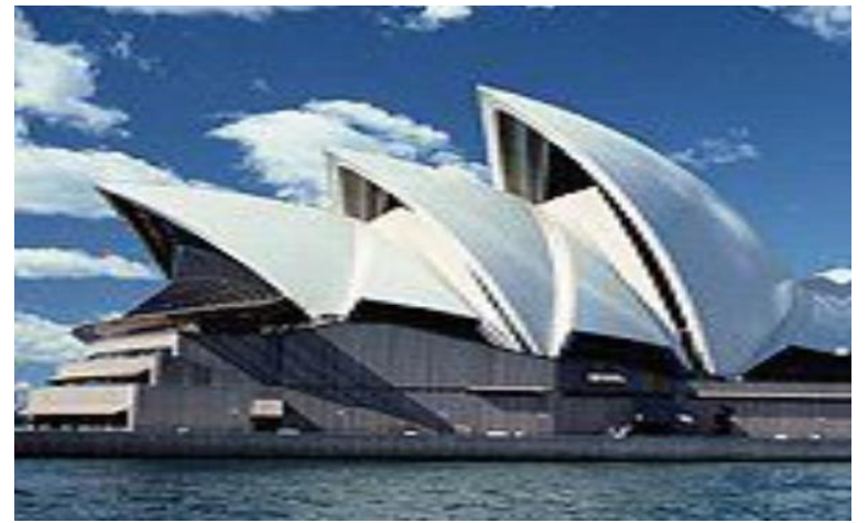
Fig (5) the architectural configuration of Sydney Opera House

One of the most important examples that clarify how the technological development affected architectural formation during the 2^{nd} half of the 20^{th} century is (Sydney Opera House 1957-1973) designed by the Danish architect (Jørn Utzon) modern technology helped in executing the concrete, cortical roof that is made from cortical concrete in the shape of interlocking sails, that are forming the architectural configuration of the building to become a distinguished sightseeing in the city of Sydney and to become an icon for architects. (fig 5)