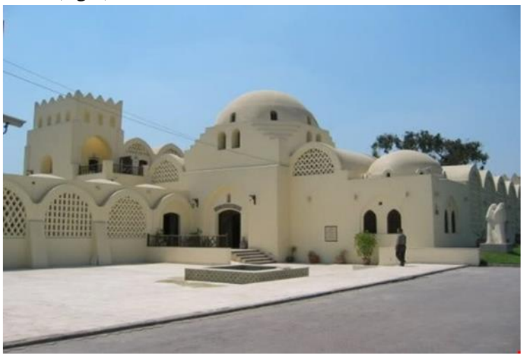
Fig (8) is an environmental design in Al-Qurna village, designed by the architect Hassan Fathy.

The invitation to originate the civilizational values in building contemporary city, shouldn't be only understood as originating artistic and architectural values in the materialistic building of cities, but it has to become parallel to the main foundation of the society itself according to the right Islamic curricula till both material and moral images integrate together (Ibrahim, Abd Al-Baky, 1987). There is no doubt that in order for Arabic, architectural intellect to produce genuine architecture, a similar role has to be carried out in the fields of developing traditional crafts that are about to be extinct such as arabesque, glazing, coloring, decorating, and engraving bricks and textiles, which are all elements contribute in adding a local privacy on the contemporary architecture. (the student, student, 2014) encouraging rational progress that is more convenient and includes color, style, decor, touch, building material, technique and creativity to produce and develop buildings. Shape 8 is an example of environmental architecture in Al-Qurna village that was designed by Hassan Fathy and he used domes and local building materials (fig 8)