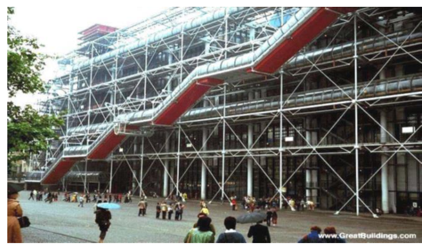
Fig (6) shows the effect of technology on construction in the architectural formation of the buildings of Pompidou cultural center- Paris-France. Designed by the architects (Rogers and Piano)