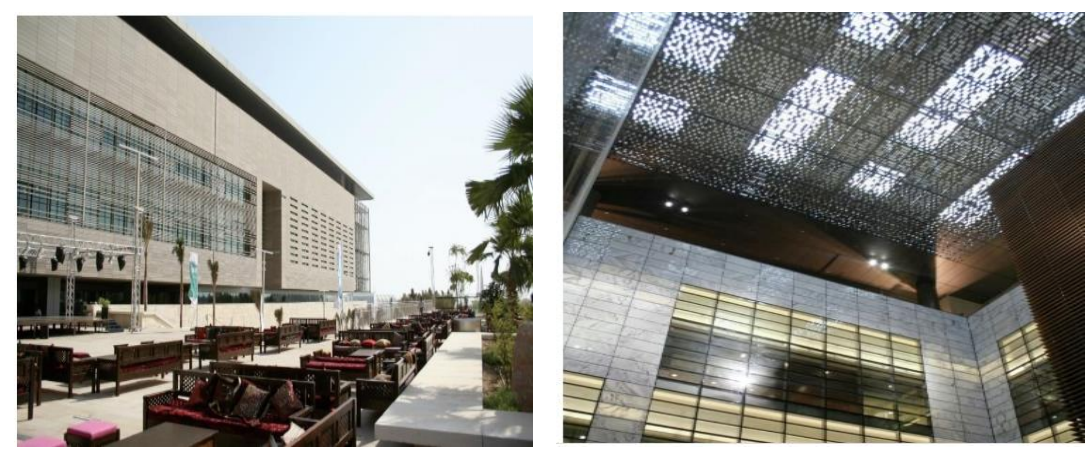
Fig (19) King Abdullah University of Science & Technology, Saudi Arabia

As for the external facades, their design is taken from Arab buildings, where small striped openings or glass facades are protected by the crushers, which is natural in traditional Arab buildings that open on their inner courtyards while their external windows are protected by mashrabiyas.