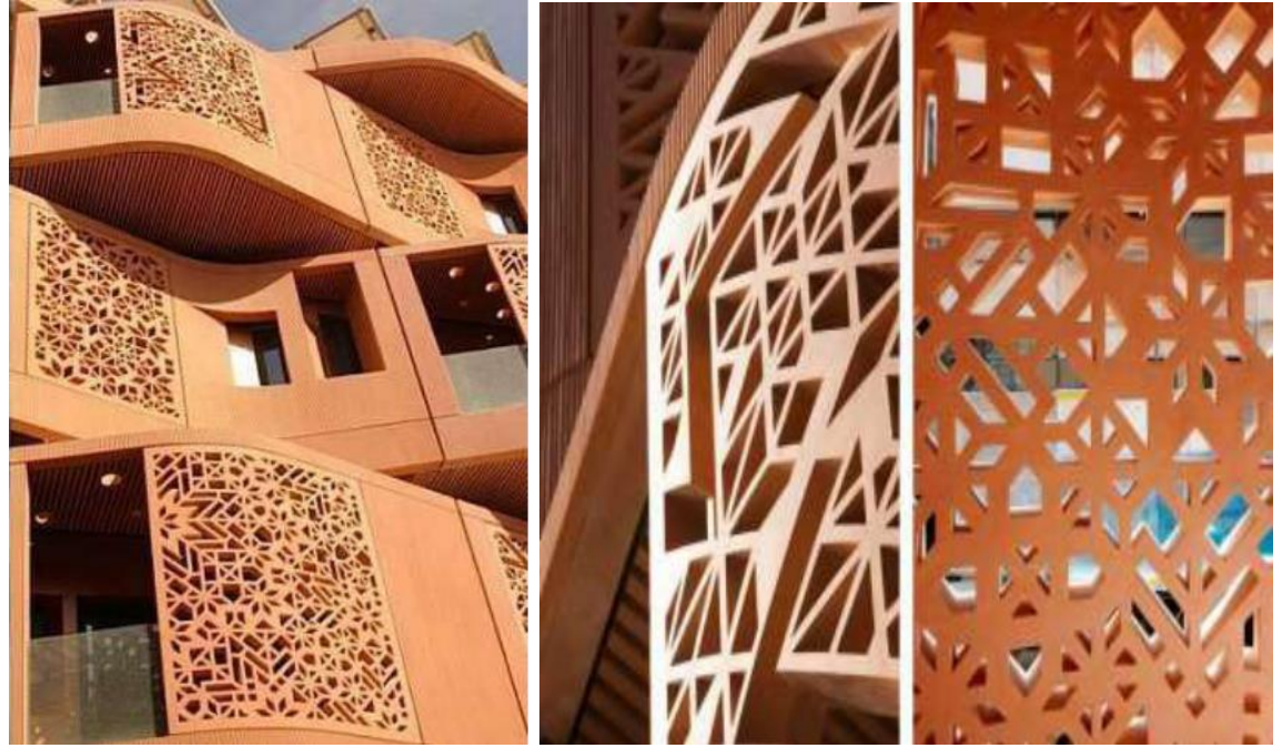
Fig (18) Masdar Inisttute environmentally facades

The UAE's contemporary adaptations of vernacular bioclimatic design also include a reinterpreted, computer-controlled wind tower rising 45 meters over Abu Dhabi's inspirationally sustainable city of Masdar (Yassine & Elgendy, 2011).