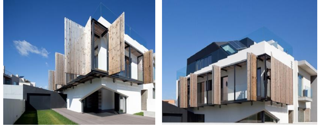
Fig (14) architectural formation at a private house using Mashrabiya (bay).

be reached through black, metallic stairs. At the top there is a working space that has a desk and 2 levels reading room with panoramic bathroom. You can exit this level to the planted roof which has been prepared for relaxation and seating.