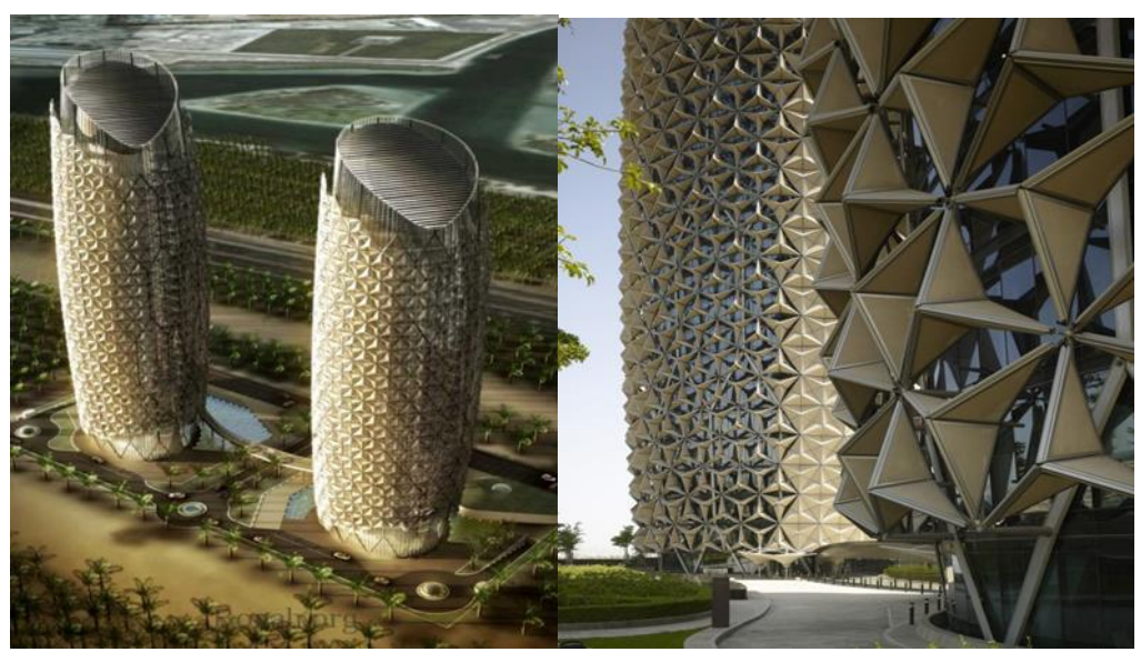
Fig (15) architectural formation at sea towers in U.A.E.

Al-Bahr Towers, On the right tower, the screens are open to let in light on the shaded portion of the building. On the right side of the left tower, the screens in full sun are closed, while on the left side those in the shadow are open (Joseph J. Hobbs, 2016). The design concept take the bioclimatic features of Gulf vernacular architecture have found a footing in modern design