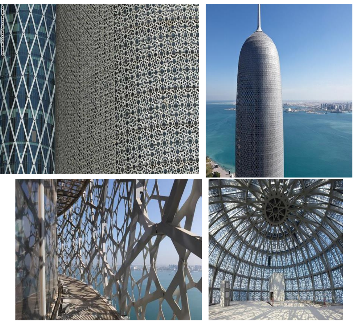
Fig (13) architectural formation and its elements in designing Al-Doha tower, the source (http://images.skyscrapercenter.com/building/doha-tower_terri-meyer-boake2.jpg)