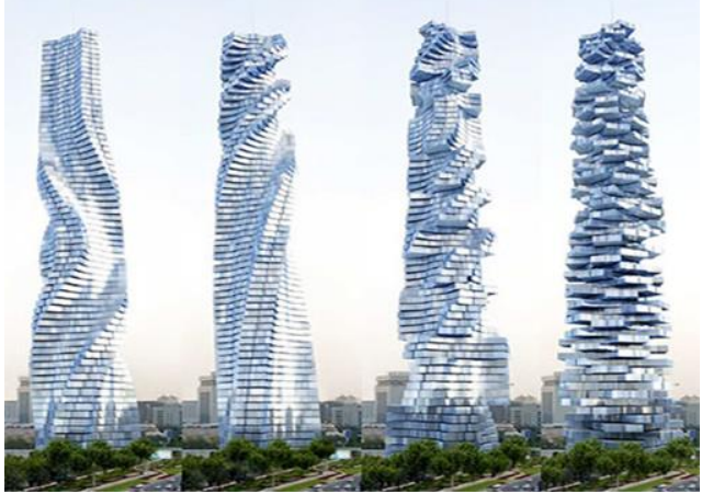
Fig( 12) elements of architectural formation at the dynamic building in Dubai designed by David Fischer

The design of the tower is based on each floor will move independently using the technology of voice recognition to give a different view each 1-3 hours.