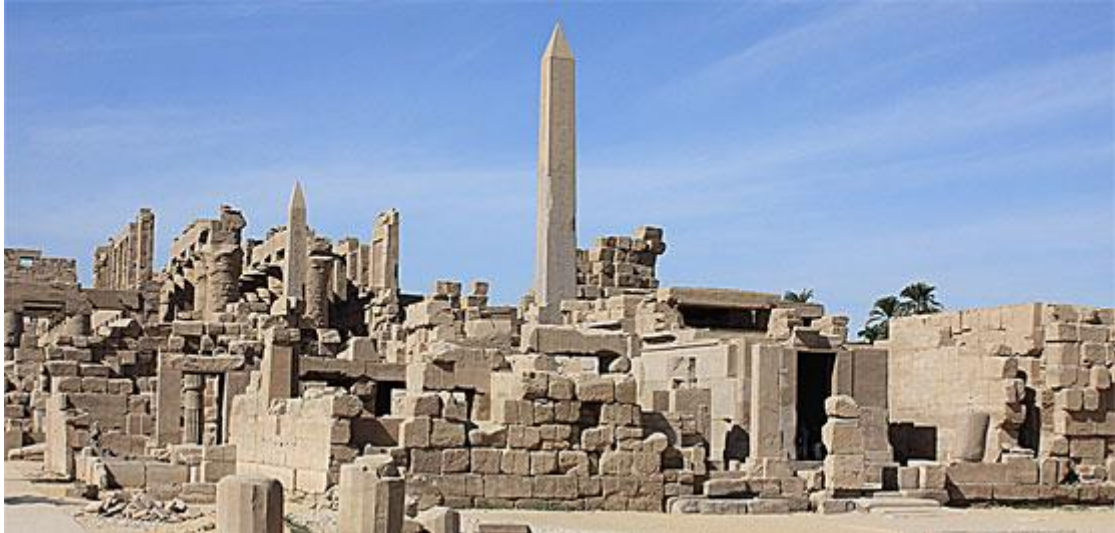
Pic1- Temple of Karnak, https://en.wikipedia.org/wiki/Karnak

Due to the availability of materials, the Egyptians have reached advanced methods of exploration of stones and minerals, transporting, lifting, cutting and polishing, which led to the advantage of Egyptian architecture by the giant scale. The Pharaonic large forms, whether a pylon or an entrance, are huge in their details because they are relatively weak sandstone in the formation. [11]