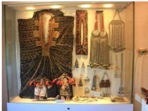
Shape 15 shows costumes and jewelry in Siwa museum- photo credit to the researcher.