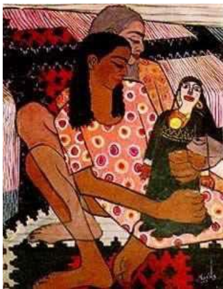
Shape18 Gazebya Serry- oil on fabric.