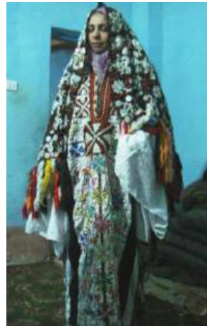
Shape 5,6 show the bridal embroidered gown. Siwa museum- photo credit to the researcher.