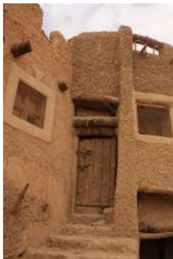
Shape 2 shows windows and doors- photo credit to the researcher- Siwa