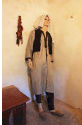
Shape 7 shows the male outfit