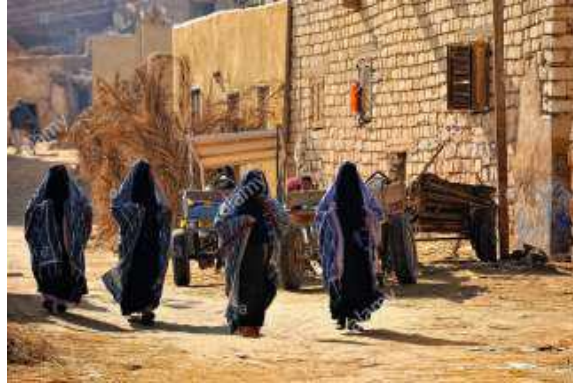
Shape 9 shows the female outfit in Siwa.