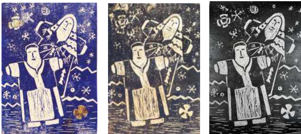
Shape 24 Lino print on paper- various color experiments- the work was shown in a collaborative exhibition in Turkey - 2014.

The researcher tried to focus on the aesthetics of the artistic work from texture, color and composition as the external analysis of the aesthetics on the characteristics of the subject that affect the aesthetical responses like size, color, composition, external look, balance, etc. while the symbolic analysis focuses on meanings, significances and symbols that are being linked to