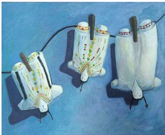
Shape 22 acrylic on roll 50*35- the work was shown in a collaborative exhibition in UAE by the ministry of culture- 2018.