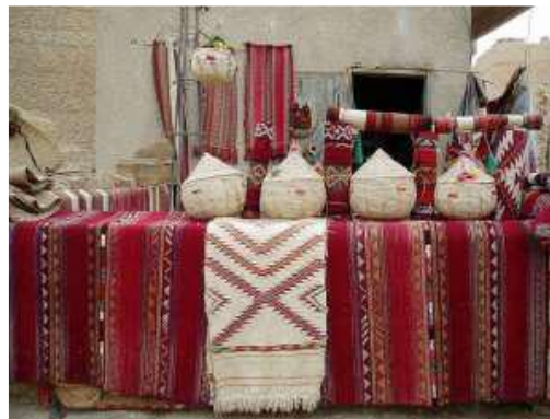
Shape 4 shows some of the handcrafts in Siwa.