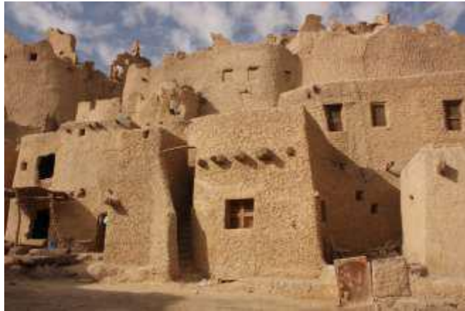
Shape 1 Shali castle- photo credit to the researcher- Siwa

Al- Maqrizi said” it’s an oasis that is inhabited by 600 persons of Berber and their language sounds like the language of Zenata. It has gardens of palm trees and is an 11 days walk from Alexandria, 14 days walk from Giza. It is famous with healing tourism and has its own, unique architecture where traditional houses are built by the archives stones which consist of salt and soft sand mixed with soil (shape1), doors and windows are made of olives, palms’ trees, (shape2).