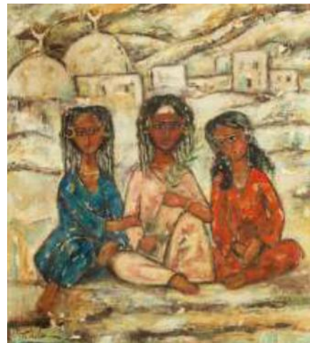
Shape17 Taheia Halim, oil on fabric.