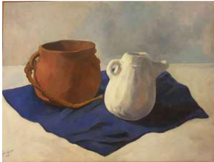
Shape 26 acrylic on roll 70*50 cm. that collection was shown among the exhibition of Siwa ceremony-2012