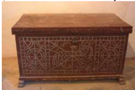
Shape 12 shows decoration on a wooden box- Siwa museum- photo credit to the researcher.