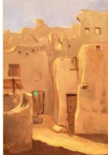
Shape 26 acrylic on roll 50*35 cm.