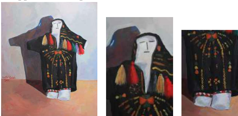
Shape 23 acrylic on roll 40*50- the work was shown in a collaborative exhibition in Turkey - 2014.