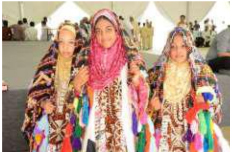
Shape 13- Siwi motifs that have been done lately