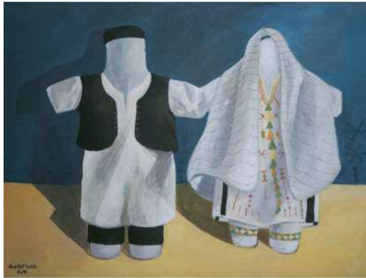
Shape 21 acrylic on roll 60*90- the work was shown in a collaborative exhibition in UAE by the ministry of culture- 2018.

The researcher tried to create a doll that is to be a symbol of the nature of life that is not just about the external appearance that it was nothing but a doll, the research confirmed that meaning by emitting the eyes as in shape 21, the purpose is for those dolls to express the nature of people in the reality but in a symbolic way through the dolls, also the use of the Siwi costumes that are being embroidered, the painting is resembling the Siwi bride and groom. The use of the blue color is to express the clarity of the weather and the freshness of the air in Siwa.