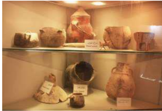
Shape 3 shows handmade pottery- Siwa museum

In the oasis of Siwa men wear short galabia with a pants beneath it and a vest on top of it and a hat, shape7. Women wear a long galabia that covers all her body. Those traditional styles are being inherited through generations all over Egypt and they reflect the folk beliefs and concepts of the nature of the environment, shape 8,9 13 .