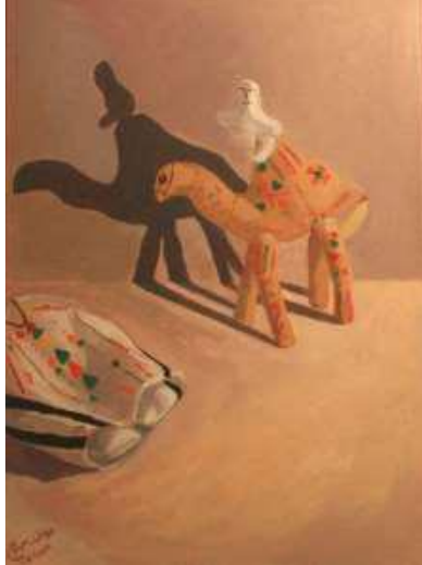
Shape 25 acrylic on roll 50*35 cm.