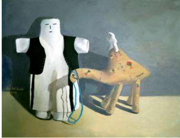
Shape 20 acrylic on roll 60*90- the work was shown in a collaborative exhibition in UAE by the ministry of culture- 2018.