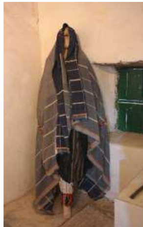
Shape 8 the bridal embroidered gown- Siwa.