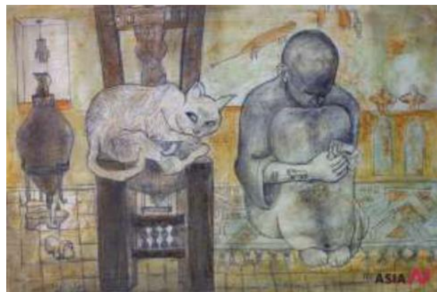
Shape19 Hamed Nada pastel and coal on cardboard.