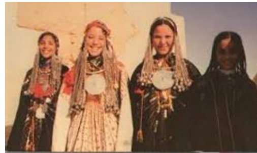
shape 14- old Siwi motifs and jewelry.