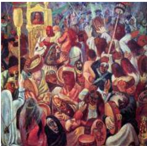
Shape16 Abd El-Hady Al-Gazar, Al-Mawled,1955.

Here we are about to discuss some examples of Egyptian artists who inspired their paintings from the folk heritage (Abd El-Hady Al-Gazar, Hamed Nada, Taheia Halim, Gazebya Serry). We find at shapes 16,17,18,19 how the folk heritage life affected those works, and how the works have expressed the Egyptian identity. One of the principles of the group of Contemporary Egyptian art is to look for whatever is bizarre in the folk life, the most significant basic that the group was concerned about is the psychological vision for what's beyond the heritage elements where all contradictions mix from truth to illusions and they have expressed those contradictions with symbols that have deep, folk significances and a skilled psychoanalysis 16 . We can notice the artists cared about adding the human element in the artistic works, it has become the basic axis that all works are revolving around. Also the color in the public heritage was linked to the folk beliefs across ages, those inheritances were reflected in the inherited folk arts generation after generation, we can find the green, red and blue colors in the same shades that have been inspired from the habitat, shade of red that resemble the color of henna, shades of blue in the color of the farmers' galabias and baby blue as the color of the Nile, shades of green that resemble fields of clover 17 .