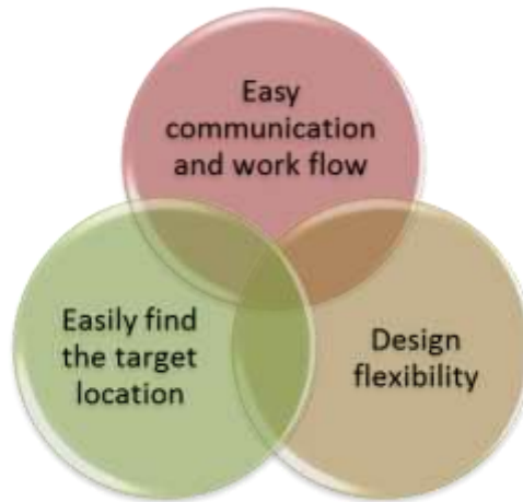
Functional methods for the use of guidance systems in administrative spaces