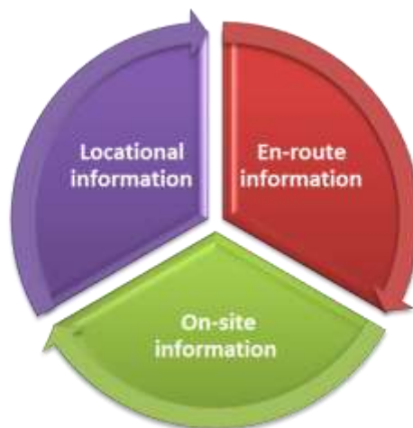
Information on guidance systems

Information on guidance systems for administrative spaces includes: