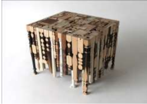
Figure (1) shows the use of some defective lath pieces in the production of an unconventional table