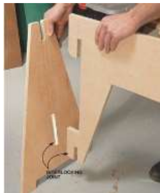
Figure (16) shows the formation of wooden pieces using digital control technology, which ensures the accuracy of the installation