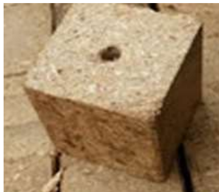
Figure (3) shows the recycling of wood waste to produce wooden blocks suitable for models of design ideas

Where the waste of factories and workshops of all types of wood is used and recycled again to make models and blocks of wooden foam-like as shown in Figure (3) can be used to form and implement design models through a production line that goes through several stages where the wood is sorted according to the classification of wood waste and then They are processed in the cutting machine where these huge wooden parts are cut into small homogeneous pieces and then comes the stage of separation of undesirable nails and metal parts, then cut these pieces into smaller pieces, then the stage of milling to obtain homogeneous granules, then the stage of agglomeration and pressing to a Wooden blocks can then be used in the formation of design ideas or products used as components of models.