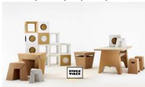
Figure (7) shows the use of cardboard in the manufacture of models of furniture pieces of various dimensions, purposes and colors

Figure (7) also shows the use of cardboard in the manufacture of models of furniture pieces of various dimensions, purposes and colors, these pieces are very economical as the price is suitable for their useful life and they are very easy to recycle (11).