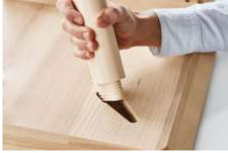
Figure (17) shows a leg formed in three-dimensional printing to enter a stable in place very accurately with ease of disassembly when needed