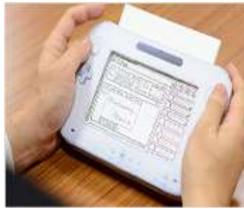
Figure (8) shows examples of paper design ideas

Through the use of modern technological methods waste paper and cardboard (magazines, newspapers, etc.) can be recycled for the manufacture of cardboard paper as shown in Figure (9), which is used in the work of design ideas models as shown in Figure (10 / a, b, c) where The waste is collected from institutions, clubs, etc. The sorting process is considered the most important stage in the recycling of paper, to get a good quality of paper, then the stage of cutting into thin and homogeneous slices by cutting machine, and the paper is immersed in water basins and then mixed Paper cut by the mixing device to obtain the desired dough and the paper is formed in different ways Then the drying stage.