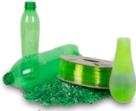
Figure (11) shows the threads of polyethylene terephthalate (PET)

It is a material used to make plastic bottles, and polyethylene terephthalate yarns are colorless transparent crystals when heated or cooled, the degree of transparency changes and when these filaments are cooled slowly for use in 3d printing machines, they have a more crystalline structure. The advantage of this material is that they withstand shocks and are used in lightweight models. The design idea is transformed into a three-dimensional physical model of this technique by drawing the proposed design idea using one of the CAD programs, and then convert it to STL format (13) where the 3D printer receives commands that allow it to convert the digital file with its data. Three-dimensional layers, which will be formed using different materials, which may be in the form of liquid or solid or in the form of powder with very small granules or in the form of flakes or strips of very small thickness may reach less than 100 microns of metal or plastic or wax, glass or other synthetic materials. (19) However, it can print any stereoscopic provided that the stereo is not larger than the size of the printer. (6) (16) The most important raw materials used in the implementation of models using three-dimensional printing technology ceramic, plastic, wax and metals (8) as shown in Figure (12)