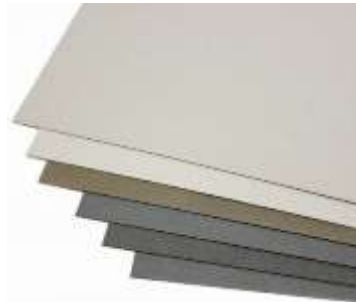
Figure (9) shows the cardboard boards

Through the use of modern technological methods waste paper and cardboard (magazines, newspapers, etc.) can be recycled for the manufacture of cardboard paper as shown in Figure (9), which is used in the work of design ideas models as shown in Figure (10 / a, b, c) where The waste is collected from institutions, clubs, etc. The sorting process is considered the most important stage in the recycling of paper, to get a good quality of paper, then the stage of cutting into thin and homogeneous slices by cutting machine, and the paper is immersed in water basins and then mixed Paper cut by the mixing device to obtain the desired dough and the paper is formed in different ways Then the drying stage.