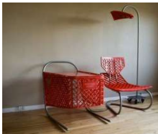
Figure (5) shows the conversion of a shopping cart useful life to three useful household products

Where plastic and metal containers are used for products and re-operating as benches, tables and home storage units, allowing these products to serve another purpose for a new period of time before thinking about recycling, which necessarily necessitates production processes that have an impact on the environment. These products are based on thermoplastic, and plastic cutting technology with 3D printing legs. Figure (5) shows the conversion of a shopping trolley after the end of its useful life to three useful household products (seat, lighting unit and storage unit with table) so that the metal parts of the cart were adapted to fit the dimensions of the required pieces of furniture using a metal plinth and a metal segment guided by a computer (1).