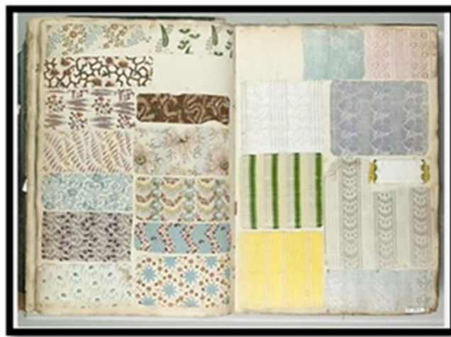
Shape (2) Sample of French fabric,1821, France

Shape (2) shows a sample of the French fabric for the year 1821