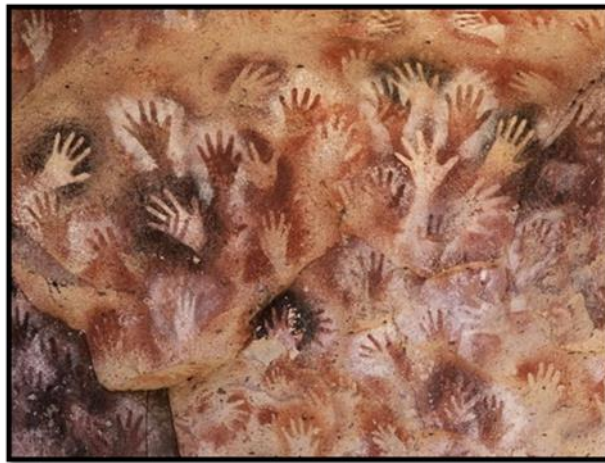
Shape (1) Some traces of palm on one of the caves

The story of printing began thousands of years ago when the person printed before he knew the writing and before he could build a house or woven fabric and painted on the walls of the caves and the ceilings of the very creative. Thus began the first man instinctively to the work of the first drawing in a simplified way when the palm of his hand on the walls of the caves Where most of the caves have effects to draw the paws, the man put his hand on the wall and then drip the dyes around it through the bones of animals as dipping his hand in the dyes and put on the wall leaving fingerprints on them and illustrated by the following image: -