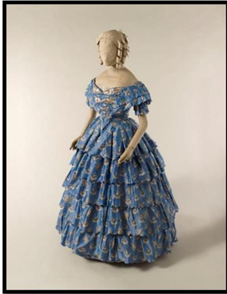
Shape (4) Silk and cotton dress, France, 1852

The following are some of the designs that were created to suit the modern age: -