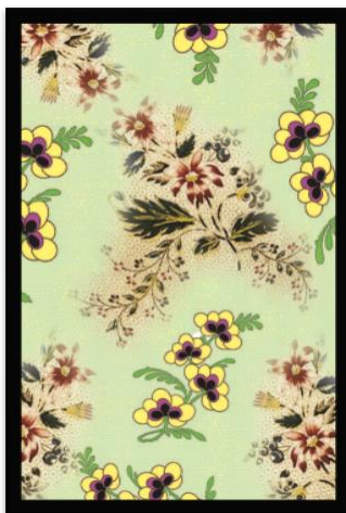
Design No. (1)

The following are some of the designs that were created to suit the modern age: -