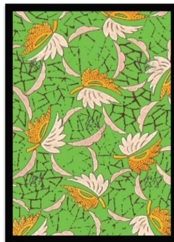
Design No. (2)