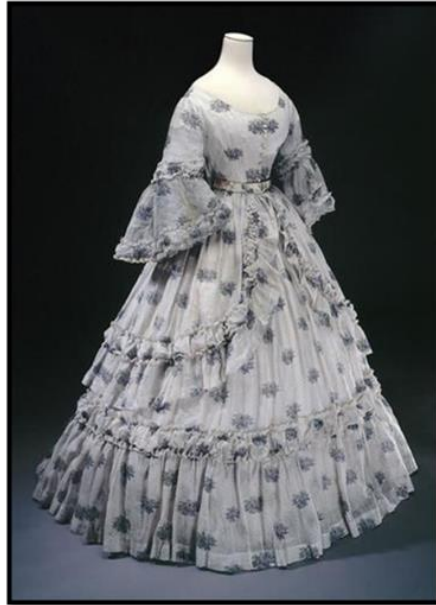
Shape (3) Printed cotton dress,1864 CE, France