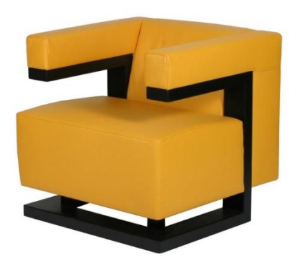
Walter Gropius Image Number 1 shows the design of one of the seats designed by

Due to the importance of bauhaus to the unity between visual arts, architecture and industrial design, the bauhaus were not a model as much as a new way of life, and in the field of furniture design the Bauhaus was interested in the call to invent new forms and designs and learn modern techniques, and stay away from decorations and reject All that is traditional, attention to the functional and economic aspects and maintain unity in the design of furniture and harmony furniture with the modern house and suitable for the narrow spaces of modern residential buildings and ease of care and the design of lightweight multifunctional furniture. Walter Gropius's designs were also characterized by the standardization required by the method of quantitative production to contribute to the economic dimension, and his ideas were followed later by many furniture factories in applying the method of product analysis for its elementary elements, whether on the functional or formal side as well as on a level The material for the design of funky furniture, and the ideal artist from the point of view of The Gropius Walter Gropius who has the ability to deal with the material as much as he knows the design theories. (1- p. 8).