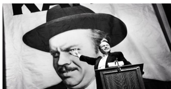
Figure (6) Both high and low angle angles and their psychological semiotics.