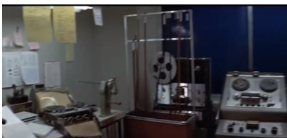
Figure (3) Film (Blow Out 1981), 360 degree shot