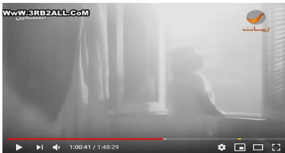
Figure (2) "The impossible" movie, Director of Photography Abd El-Aziz Fahmy, Dramatic expression by lighting.