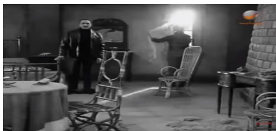
Figure (4) The use of the short focal length lens to express the psychological reality in film "My wife and the dog"