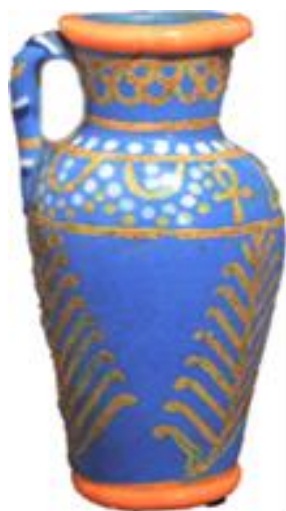
Figure (1): one of the earliest Egyptian glass vessels about 1425 B.C, height 8.7 cm., British museum, Uk.

In all likelihood, the Egyptians learned glassmaking from their Asiatic neighbors, possibly from captives taken during Egyptian military campaigns in the East under the eighteenth-dynasty pharaoh Thutmosis III (1490–1436 B.C.). The glass industry, once transplanted to Egypt, grew vigorously, fueled in part by the abundance of the raw materials required to manufacture glass. Egyptian workshops not only produced a variety of wares for consumption by the royal court and aristocrats, who could afford such luxuries, but also exported large quantities of raw glass.