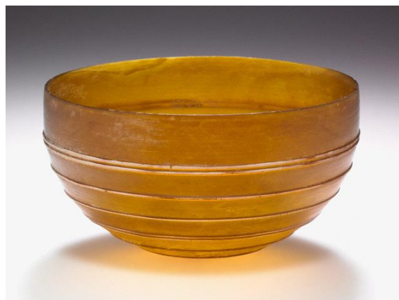
Figure (3): Amber Bowl with White Ridges, Roman, 1–100 C.E., cast glass 4-1/16 inches in diameter (The J. Paul Getty Museum, 2003.475).

Casting is a technique of pouring hot glass into a mold. After the glass cools, glassmakers use various grinding and cutting techniques to refine the vessel's form and decoration. Any of several glassmaking techniques involving the use of single (open), multipart (closed), or former molds.