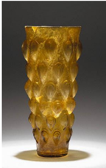
Figure (4) Lotus Bud Beaker , Roman, Eastern Mediterranean, 1st century C.E., mold-blown glass, 8-3/8 inches (The J. Paul Getty Museum, 2003.320).

commonly identified as a lotus bud motif. Five rows of knobs protrude from the body of this fairly small example, with raised circular dots appearing in the spaces between the knobs. The size of the vessel, the absence of relief decoration toward the top of the body, and the slightly splayed rim may indicate an intended function as a drinking vessels Figure (4).