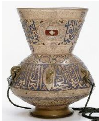
Figure(5): mosque lamp ,mamluk period ,V&A Museum

This mosque lamp is an example of the fine gilded and enameled glass manufactured under the Mamluk dynasty, which ruled Egypt and Syria between 1250 and 1517. The design, dominated by a large-scale inscription in blue enamel, is typical of work produced around 1300 to 1350. The moldings below the mouth of the bottle and around the top of the high foot indicate that the form of this vessel is based on a precious-metal prototype, for which the moldings would have been structurally necessary.