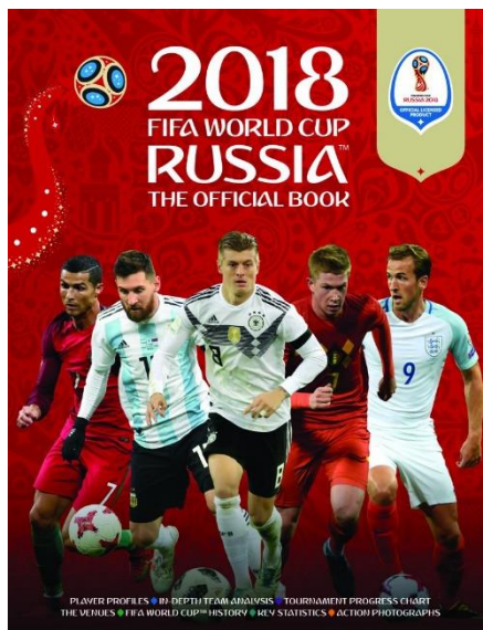
Figure 3: Russia FIFA World Cup official book cover 31

In another designs the blue color of the identity was mostly used. As presented in figure (4) the tickets' were designed using the blue color of the logo to convey the connection between the national identity and the event. The design also contained graphic treatments to the Russian milestones in colorful forms to convey a feeling of enjoyment. The direction of the ball that was used in the design direct the eye's movement to the event logo.