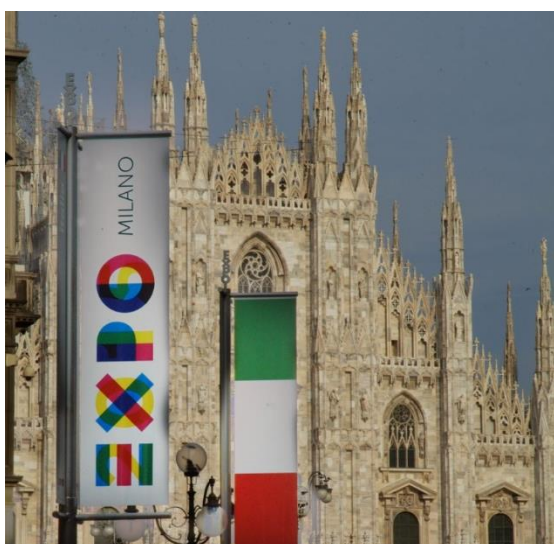
Figure 7: Italy's flag 37

They used to print the flag in different places as presented in figure 7 and the flags of the guest's nations as shown in figure 8 that in turn may indicate that they are a welcoming country and it will reflect positively on its national image.