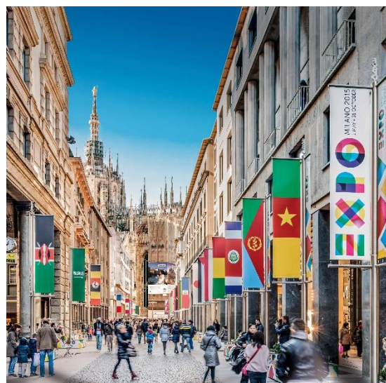
Figure 8: Guests' countries flags 38

In most of their designs they used illustration abstracted from the logo and made of its colors expresses the main tourist attractions and landmarks that distinguish Italy from another country that will make the event memorable in the minds of target audience in addition to be linked to the country that will in turn have positive impacts on the national image. These illustrations are presented in figure (9).