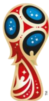
Figure 2 represents the official logo of Russia 2018 FIFA World Cup. In this design they the red and blue colors inspired from Russia flag colors in coloring the cup to frame their identity. The golden lines formed two men raising their hands as indication to victory. They confirmed the concept by using glimmering spots and stars.