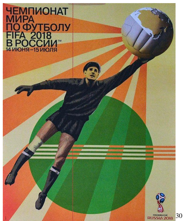
Figure 1: Russia FIFA World Cup Official Poster

Figure 2 represents the official logo of Russia 2018 FIFA World Cup. In this design they the red and blue colors inspired from Russia flag colors in coloring the cup to frame their identity. The golden lines formed two men raising their hands as indication to victory. They confirmed the concept by using glimmering spots and stars.