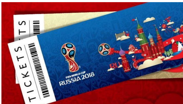
Figure 4: Russia FIFA World Cup ticket 32

In another designs the blue color of the identity was mostly used. As presented in figure (4) the tickets' were designed using the blue color of the logo to convey the connection between the national identity and the event. The design also contained graphic treatments to the Russian milestones in colorful forms to convey a feeling of enjoyment. The direction of the ball that was used in the design direct the eye's movement to the event logo.