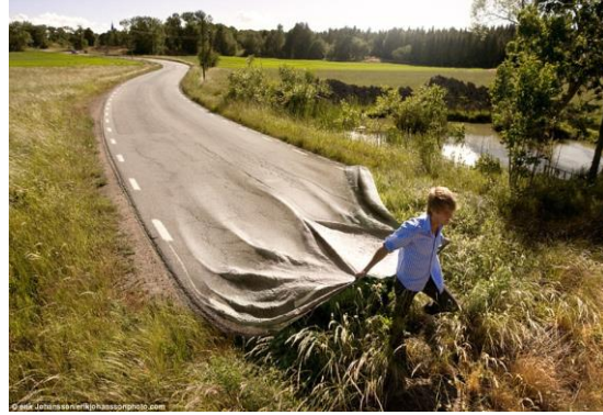
Form\Take your way. Or customize your way from Eric's paintings Johansen Name Go your own Road 2008