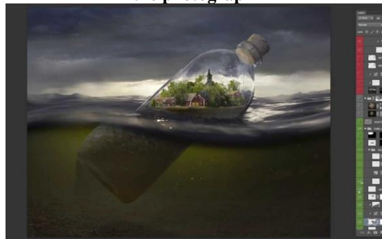
Form13) Treatment Graphic When it filmed Under the name Drifting Away.