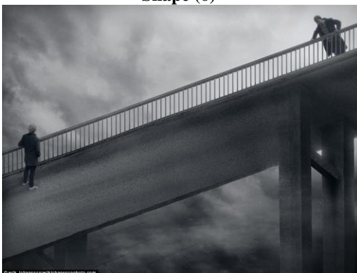
Shape (7) Sides of bridge