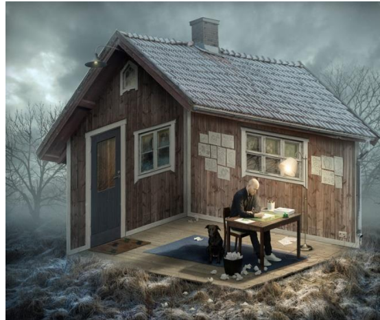
Form10) Visual deception with different visualization of vision In the name of architecture The Architect 2015