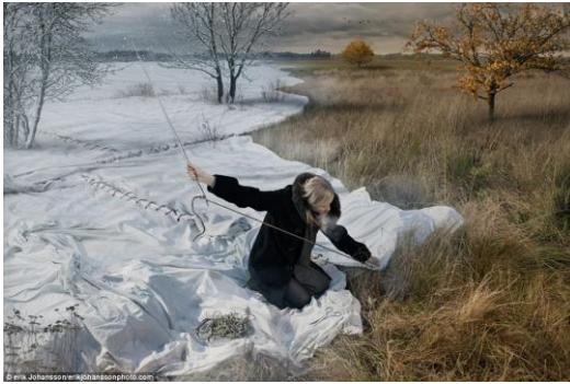
Form 4) In the name of winter prediction Expecting Winter 2013