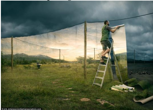
Form (5) as cover The Cover up 2013