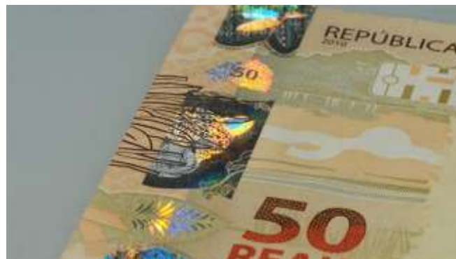
Pic No.(7) Brazil 50 Reais with partially metallized KINEGRAM stripe. Source: [12]