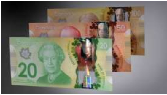
Pic No.(3) Canada Dollar series with KINEGRAM stripe over window.