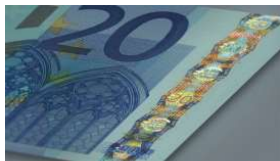
Pic No.(6) 20 EURO with KINEGRAM continuous stripe.