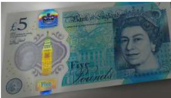
Pic No.(5) England 5 Pounds with KINEGRAM COLORS. Source: [12]