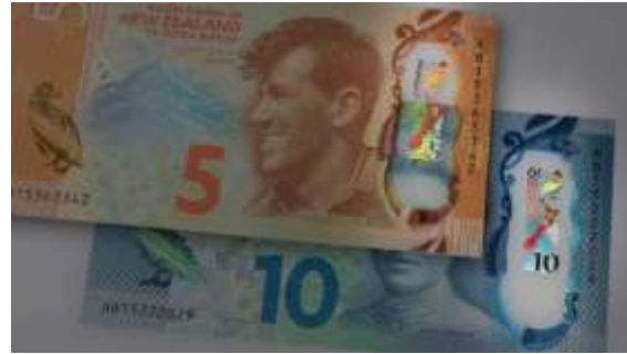
Pic No.(4) New Zealand 5 and 10 Dollar with KINEGRAM ZERO.ZERO patch.