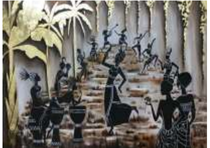
Printed textile wall-hanging that combines the African art and metal wall-