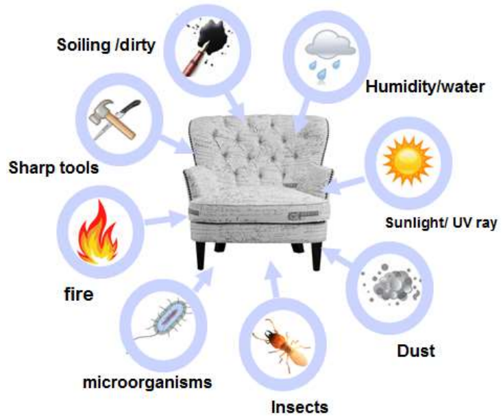
Figure (1) some factors that lead to furniture damage

The research deal with all the above factors in detail. The following is brief example: