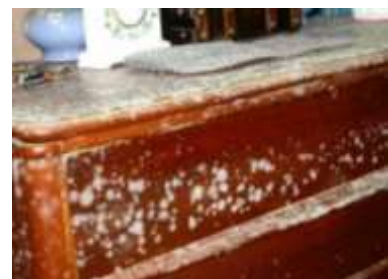
(3) White Mold On Wood

▪ Material exposed to damage : The organic materials of furniture product (wood, leather, textiles, paper,... etc.) Are subject to damage due to biological agents ( photo 1:3) , but all furniture materials, whether organic or inorganic are surfaces that stick to microbes or bacteria and then transferred to human.