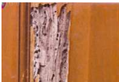
(1)Termite lead to wood damage

Biological agents are the most dangerous factors in the presence of moisture as they provide a suitable environment for the growth and presence of microorganisms and their reproduction. the most serious is insect infections on furniture materials because it may lead to destroy materials after a very short period.