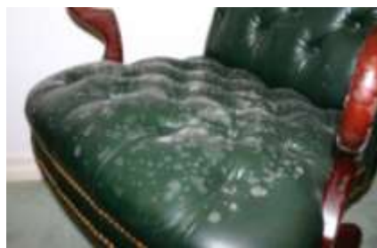
(2) leather mildew