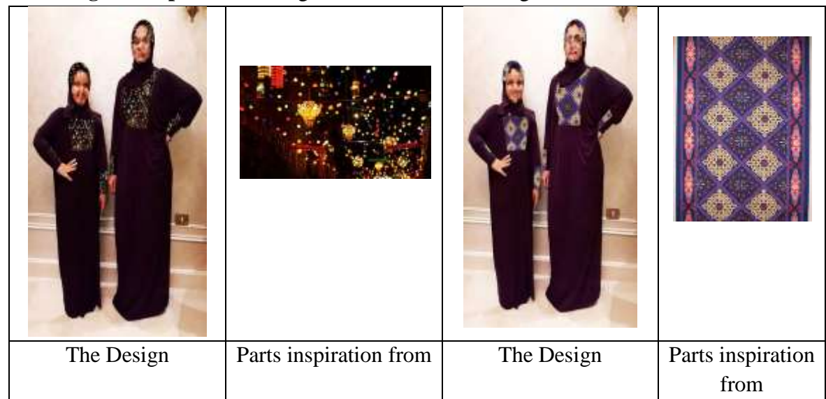
Fifth Design Group: Mother-daughter Isdals of same design-