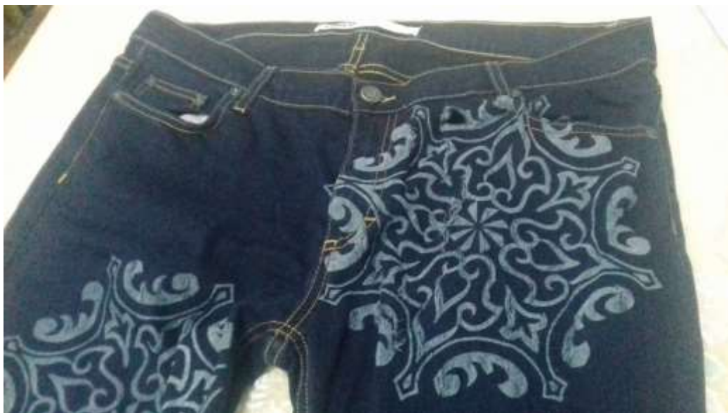
Figure 3. application of laser engraving on complete denim trousers