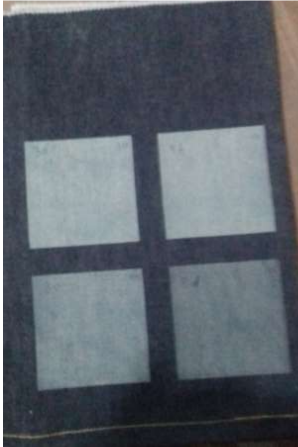
Figure 2. shows engraved square pattern of samples

Square patterns with dimensions of 10 cm x 10 cm were engraved according to various combinations of resolution and Laser power (four square pattern fabric samples were prepared for each combination) as shown in Figure 2 engraved square pattern of samples at different irradiated CO 2 laser powers. Figure 3. shows the application of laser engraving on the complete denim trousers.