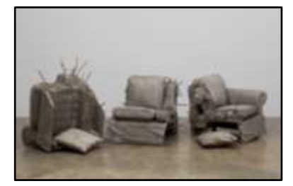
Form (4) Form (5)