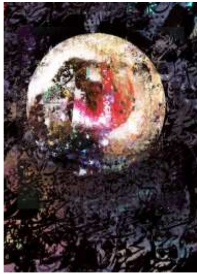
Design 5: 50cm / 70cm