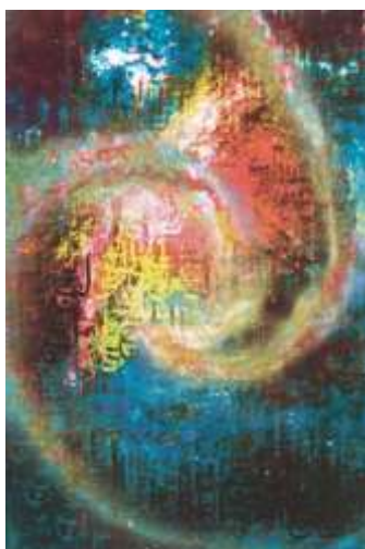
Design 17: 45cm / 70cm