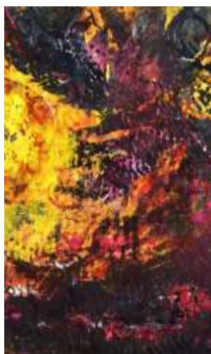
Design 16: 50cm / 70cm

Designs 13 and 14 show a planet in our Galaxy (Mars/ Venus) and stars with layers of Arabic letters using degradations and contrasted colors to stress the 3D form. Design 15 presents a photo of a Star Cluster Burst into Life and Cosmic space with dust by using the different types of letters and words from kufi and thuluth with different textures and mixing hot colors in some areas to create depth and contrast.