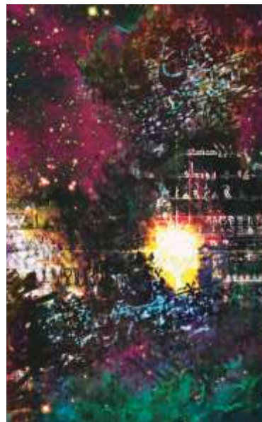
Design 15: 50cm / 70cm

Designs 13 and 14 show a planet in our Galaxy (Mars/ Venus) and stars with layers of Arabic letters using degradations and contrasted colors to stress the 3D form. Design 15 presents a photo of a Star Cluster Burst into Life and Cosmic space with dust by using the different types of letters and words from kufi and thuluth with different textures and mixing hot colors in some areas to create depth and contrast.