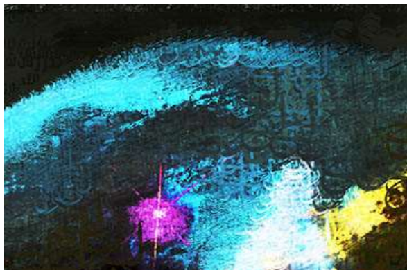
Design 25: 70cm / 50cm

Designs 24 and 25 depict Sunrise over the earth and viewing the beauty and the uniqueness of our earth. Various types and sizes of words / letters with different colors are used to stress depth. In both designs there is a stress on color manipulation and gradations, using dark color in some areas and outside the shape of the earth to present the 3D form. It shows part of the Earth where it is away from the Sun and the space looks black because there is no close bright source of light, like the Sun. Both designs focus on the reflection of light on some areas in the surfaces of the earth to portray its beauty and uniqueness.