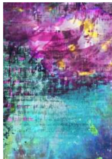
Design 3: 50cm / 70cm