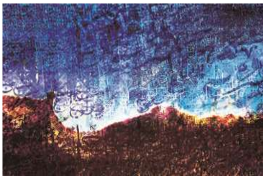
Design 22: 70cm / 50cm

In design 19 , a layer of some words was mixed with a layer of a cosmic object called: The Ant Nebula. The repeated letter was applied to stress the shape of the Nebula. The cold and hot colors were used to show the light effect. Design 20, on the other hand , is combining a hand drawing of a Butterfly Nebula and photos of stars and repeated letters. The design was based on letters of different sizes and mixing hot and cold colors to achieve movement and variation in order to create attraction and balance. Design 21 shows various layers of different types of letters with a cosmic picture of Crab Nebula. The design was based on multiple sizes of letter and the use of gradations around the outer shape of the cosmos object to achieve harmony and balance with using three colors such as: blue, shades of red and black.