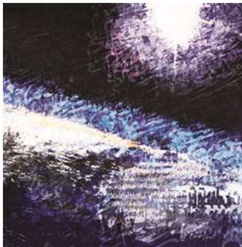
Design 24: 50cm / 60cm