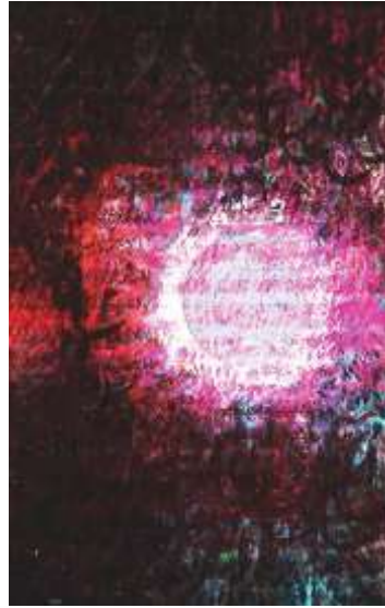
Design 8: 45cm / 70cm