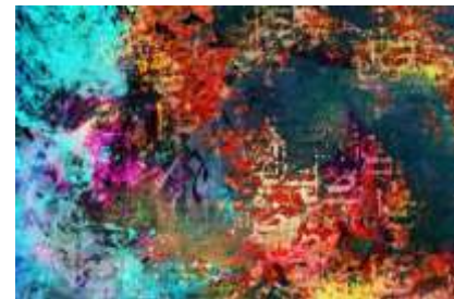
Design 12: 70cm / 45cm

Designs 11 and 12 focus on using different sizes of Arabic letters and words brushed in Photoshop on the images of Supernova, a Galactic Spectacle and The Cat's Eye Nebula. Design 10 presents the repetition of different sizes of red and blue Nebulas with stars in different colors with modern forms of Alif (ا) with dots (Arabic calligraphy letters are usually measured with dots).