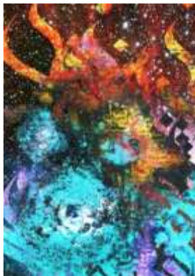
Design 10: 45cm / 70cm

Design 7 5 presents the mystery of black hole (astronomical phenomenon) as it gathers mass and consume the dust and gas from the galaxy around them, allowing them to grow to enormous sizes. Design 8 expresses the solar eclipse phenomenon – this eclipse occurs when the Moon totally or partially blocks the Sun. Thulth letters were used brushed with different colors and sizes to stress the eclipse phenomenon. Design 9 focuses on repeating mainly the Ain letter (ع) by merging the different cosmos objects such as cat eye nebula, Orion Nebula & Supernova 1987A (supernova is the explosion of a star). They are used in multiple color gradients with hot and dark colors to experiment with the contrast to achieve rhythm and a balanced design.