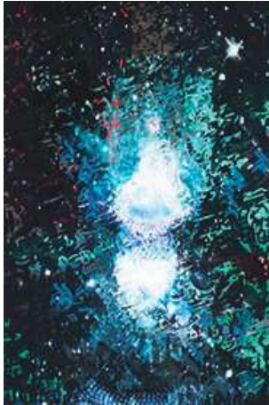
Design 19: 50cm / 70cm