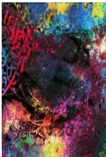
Design 2: 50cm / 70cm