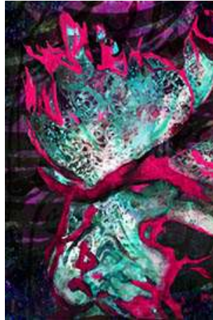
Design 20: 40cm / 60cm