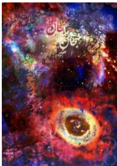
Design 1: 50cm / 70cm

This part will show the potential of Computer aided design- CAD- software, different images of cosmos and Arabic calligraphy for experimentation and how new aesthetic and artistic wall hanging can be created. It will show the 25 designs that are created by combining different types of cosmic objects (photos collected from NASA website, books or from astronomy apps.) with different styles of Arabic calligraphy, letters or words, to fill in the background using CAD software (photoshop).