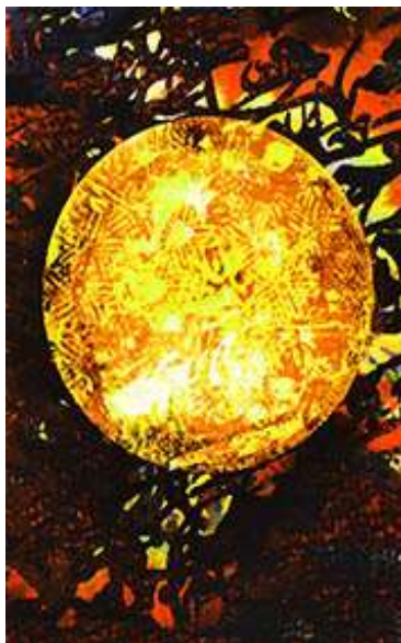
Design 13: 45cm / 65cm