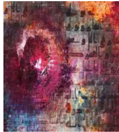
Design 6: 60cm / 40cm

However, design 4 ,5 and 6 show different artistic interpretations of galaxy, stars imagery and different sizes of the image of Light Echoes from a Red Supergiant (an image of the shells of dust surrounding the aging star V838 Monocerotis) overlapping with different styles and sizes of Arabic calligraphy. These designs rely on creating different dominant points by stressing the red colour of the aging supergiant star and breaking the movement of the circles by different sizes of letters or qur’anic words and by changing colors, using dark with contrasted colors and textures in order to create exciting designs.