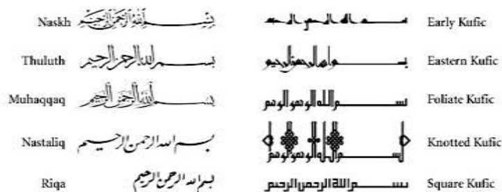
Figure 2. Illustrating Kufic and Cursive styles of Arabic writing

ElAraby (1997) declares that the starting of the Kufic calligraphy opened the door to artists and calligraphers to develop a vast variety of calligraphic styles that continued for centuries. Several styles of script have been developed over time, each with an array of expressions and different compositions. These include Kufic and Cursive styles (Figure 1) (Moustapha & Krishnamurti 2001, 294).