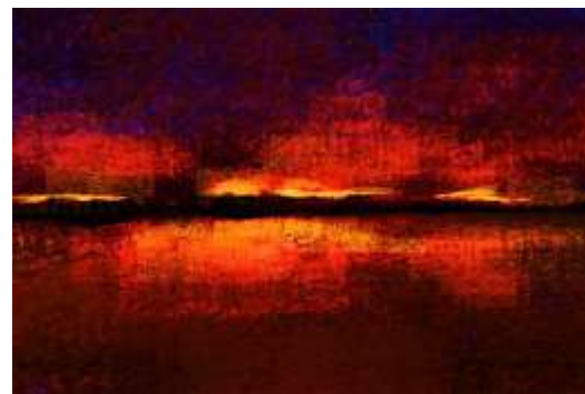
Design 23: 70cm / 50cm

Design 22 shows a 'landscape' image from the cosmos. It presents the use of stars and overlapping of the repeated multiple sizes of letters and different tones of color to construct the shape of "hills and valleys" in the cosmos. Design 23 presents a layer of some words that is mixed with a layer that depicts the image of sunrise on Earth. The design aims to achieve a sense of the glowing of sunrise by using arrays of words with multiple dimensions and gradations to achieve relaxation and to fulfill visual attraction with a sense of depth. Hot and cold colors are used together to achieving harmony.