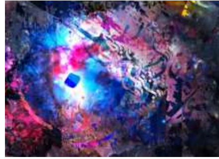
Design 21: 40 cm /60 cm

In design 19 , a layer of some words was mixed with a layer of a cosmic object called: The Ant Nebula. The repeated letter was applied to stress the shape of the Nebula. The cold and hot colors were used to show the light effect. Design 20, on the other hand , is combining a hand drawing of a Butterfly Nebula and photos of stars and repeated letters. The design was based on letters of different sizes and mixing hot and cold colors to achieve movement and variation in order to create attraction and balance. Design 21 shows various layers of different types of letters with a cosmic picture of Crab Nebula. The design was based on multiple sizes of letter and the use of gradations around the outer shape of the cosmos object to achieve harmony and balance with using three colors such as: blue, shades of red and black.