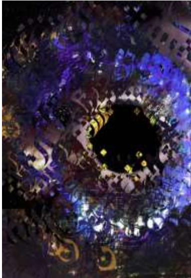
Design 7: 45cm / 60cm