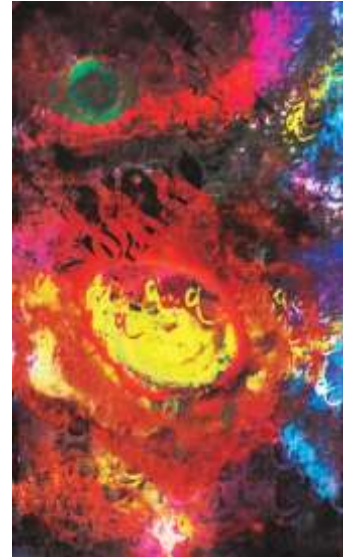
Design 9: 45cm / 70cm

Design 7 5 presents the mystery of black hole (astronomical phenomenon) as it gathers mass and consume the dust and gas from the galaxy around them, allowing them to grow to enormous sizes. Design 8 expresses the solar eclipse phenomenon – this eclipse occurs when the Moon totally or partially blocks the Sun. Thulth letters were used brushed with different colors and sizes to stress the eclipse phenomenon. Design 9 focuses on repeating mainly the Ain letter (ع) by merging the different cosmos objects such as cat eye nebula, Orion Nebula & Supernova 1987A (supernova is the explosion of a star). They are used in multiple color gradients with hot and dark colors to experiment with the contrast to achieve rhythm and a balanced design.