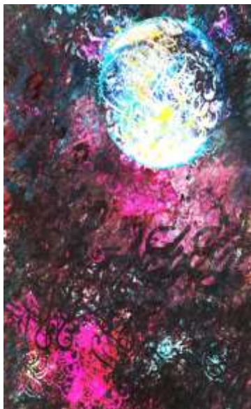
Design 14: 50cm / 70cm