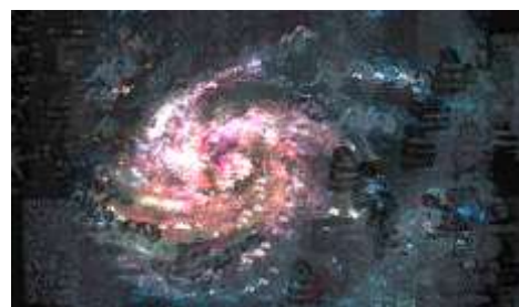
Design 18: 40cm / 60cm

Design 16 is a mixture between a scanned hand drawing of sun and dust with photos of explosions from the Sun's surface, together with a repeated Alif letter, dots and other Arabic letters, using contrasted colors to present the burst. Design 17 and 18 portray unique combinations of Spiral Galaxy, stars and Galaxy Clusters with the use of different types of letters and changing the color and textures. The contrast shows the form of the spiral shape and achieves harmony.