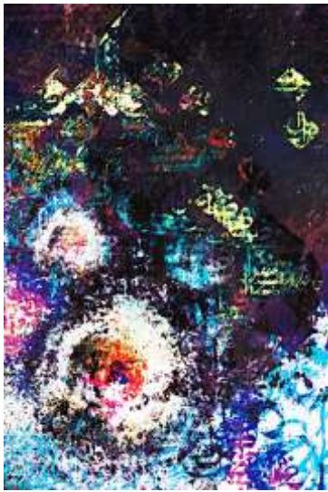
Design 4: 50cm / 70cm

An Arabic calligraphy phrase like “Glory to God” was combined with photos of Ring Nebula and Orion Nebula from Cosmos such as in Design 1 where golden colored dots were used in a circular shape around Orion Nebula and repeated in some areas with different sizes and colors of Arabic words and stars for achieving the effect of movement and balance. The hot and cold colors are used to achieve harmony and contrast in the visual perception of forms. Design 2 presents the merging of images from Nebula (defined as a cloud of space gas and dust) and Galaxy by using the repetition of few Arabic letters and multiple gradients to achieve depth. The use of hot and cold colors shows contrast and harmony in design elements. In Design 3 a layer of some Arabic characters (kufi) is repeated in the background to stress the shape of the Galaxy and Star Clusters. The letters and qur’anic texts were distributed in different sizes, shapes and colors to achieve depth and balance.