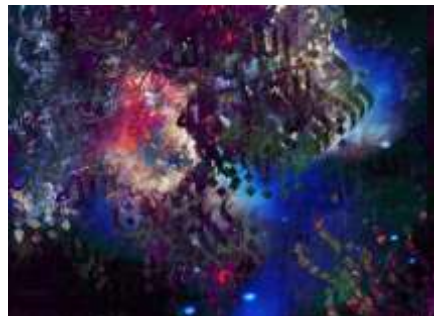
Design 11: 70cm / 45cm