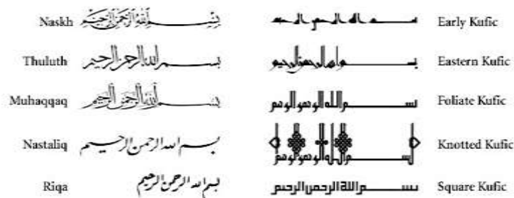
Figure 2. Illustrating Kufic and Cursive styles of Arabic writing

ElAraby (1997) declares that the starting of the Kufic calligraphy opened the door to artists and calligraphers to develop a vast variety of calligraphic styles that continued for centuries. Several styles of script have been developed over time, each with an array of expressions and different compositions. These include Kufic and Cursive styles (Figure 1) (Moustapha & Krishnamurti 2001, 294).