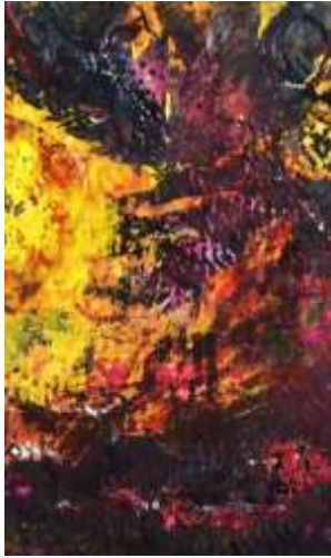
Design 16: 50cm / 70cm