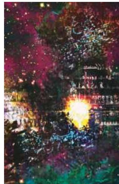
Design 15: 50cm / 70cm

Designs 13 and 14 show a planet in our Galaxy (Mars/ Venus) and stars with layers of Arabic letters using degradations and contrasted colors to stress the 3D form. Design 15 presents a photo of a Star Cluster Burst into Life and Cosmic space with dust by using the different types of letters and words from kufi and thuluth with different textures and mixing hot colors in some areas to create depth and contrast.