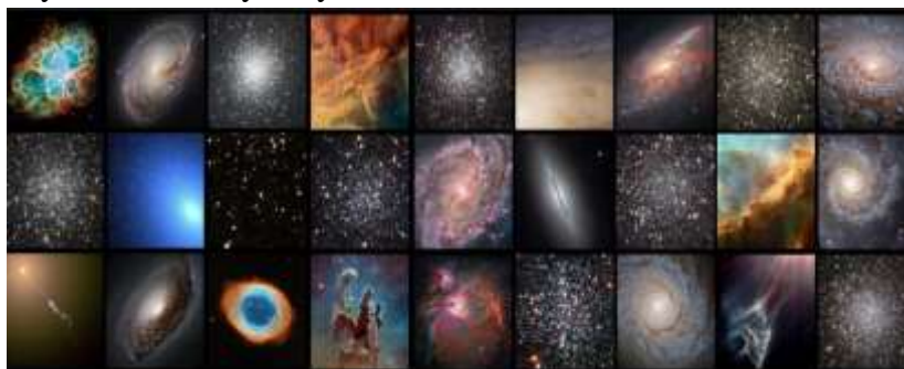
Figure4: Hubble's Messier Catalog 4 - Deep-sky object NASA

Any of various cosmic objects such as galaxies, planetary nebulae, diffuse nebulae, star clusters, double stars, and supernova that are observable only by Space Telescope because they are not visible to normal eyesight. These objects, as figure 4 shows, are beyond our solar system and far beyond the Milky Way.