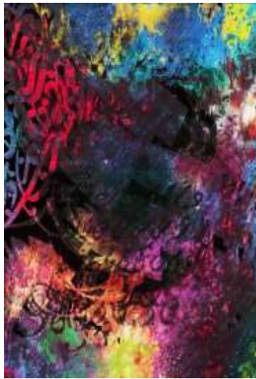
Design 2: 50cm / 70cm