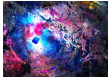
Design 21: 40 cm / 60 cm

In design 19 , a layer of some words was mixed with a layer of a cosmic object called: The Ant Nebula. The repeated letter was applied to stress the shape of the Nebula. The cold and hot colors were used to show the light effect. Design 20, on the other hand , is combining a hand drawing of a Butterfly Nebula and photos of stars and repeated letters. The design was based on letters of different sizes and mixing hot and cold colors to achieve movement and variation in order to create attraction and balance. Design 21 shows various layers of different types of letters with a cosmic picture of Crab Nebula. The design was based on multiple sizes of letter and the use of gradations around the outer shape of the cosmos object to achieve harmony and balance with using three colors such as: blue, shades of red and black.