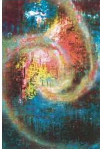
Design 17: 45cm / 70cm