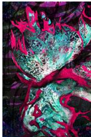
Design 20: 40cm / 60cm