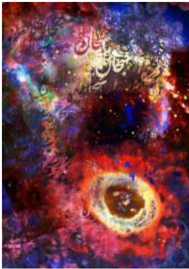
Design 1: 50cm / 70cm

This part will show the potential of Computer aided design- CAD- software, different images of cosmos and Arabic calligraphy for experimentation and how new aesthetic and artistic wall hanging can be created. It will show the 25 designs that are created by combining different types of cosmic objects (photos collected from NASA website, books or from astronomy apps.) with different styles of Arabic calligraphy, letters or words, to fill in the background using CAD software (photoshop).