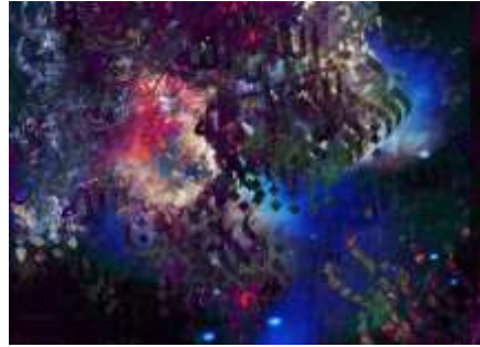
Design 11: 70cm / 45cm