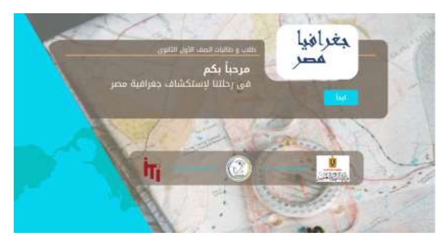
Figure 2. the home page design

The concept of beauty, utilitarianism and simplicity has been achieved in several stages. First: the home page design (Figure 2).