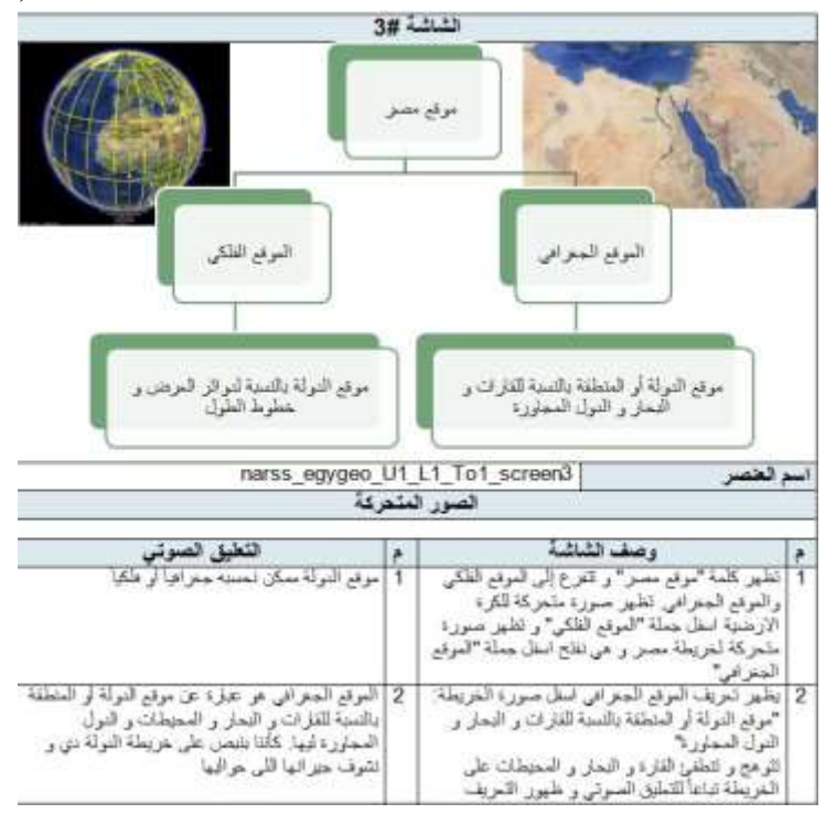
Figure 5. Part of the scenario and the method of application

The course's scientific content is designed based on the scenario that has been prepared and reviewed (Figure 5)