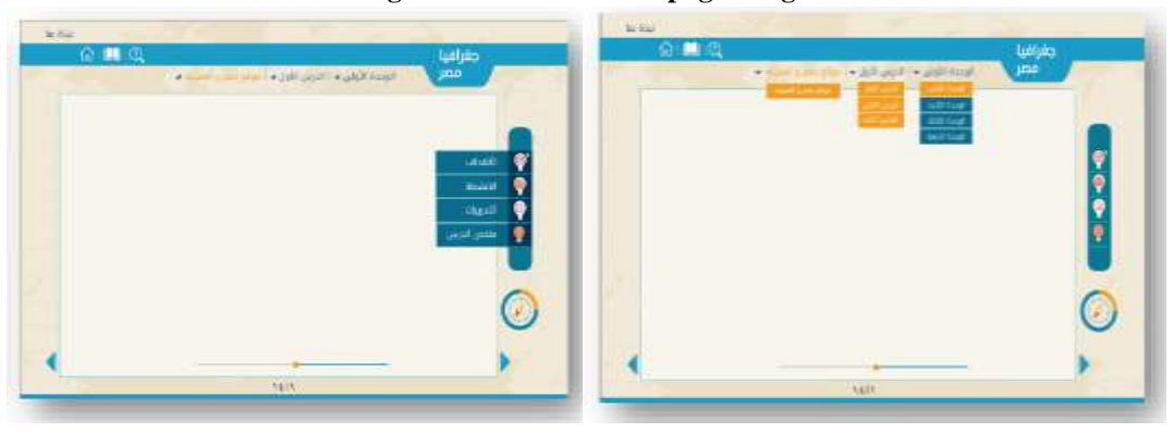
Figure 4. the internal pages design