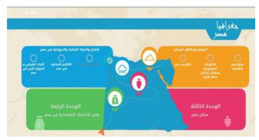
Figure 3. The first inner page design

The outer frame design of the first inner page is as a guide for the four units of decision (Figure 3). However, the outer frame of the internal pages is designed with the scientific content (Figure 4).