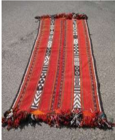
Figure (4): Besat (Runner).