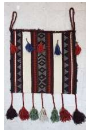
Figure (9): Adel.

is placed to the north while the other side is placed to the south and the front of Bait-al-Sha'ar faces the east. Next the Bait's pegs (Awtad) are hammered to the ground at reasonable distances from the roof of the Bait and the ropes are tied loosely to the Bait's pegs (Al-Azme, Hamad, personal communication, July 20, 2017).