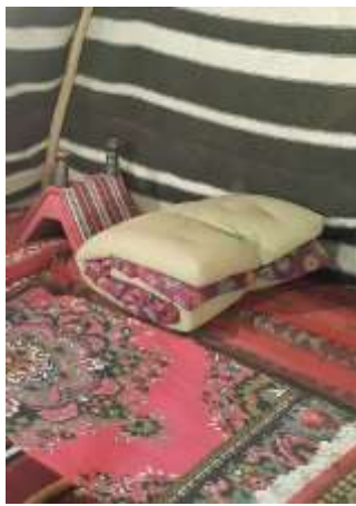
Figure (6): Firash (Mattress).