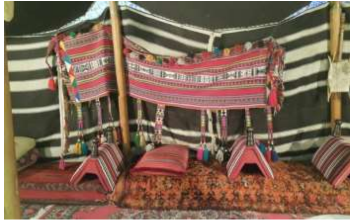
Figure (5): A seating arrangement with a Zoleyah on the floor mattress, a Masnad (pillow), three (3) Shedads (camel saddles) to be used as arm resting cochins, and a wall hanging decoration.