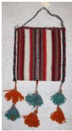
Figure (7): Mezwadah.