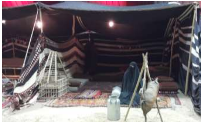
Figure (3): A tent divider "Qatta" is used in Bait-al-Sha'ar to separate the men's quarter from the women's quarter.

front or rear sides of Bait-al-Sha'ar are two (2) meters long. These tent poles are used to raise and support the roof of Bait-al-Shaar, and they are placed under it in sets of three pole. The sets of three poles that are located at the right and left side of Bait-al-Sha'ar are called "Emdan-al-Tawaref" (figure 1 #6-8 & figure 2 #11-13), which have different names than the rest of other poles. The front pole is called "Yad-al-Bait" or "Al-Tarfah Al-Amameyah", which means the arm of the tent (figure 1 #6 & figure 2 #11). The rear pole is called "Rijil-al-Bait" or "Al-Tarfah Al-Khalfiyah", which means the leg of the tent (figure 1#8 & figure 2 #13), and the pole in the center is called "Amood Al-Amer" (figure 1 #4 & figure 2 #12). Also, each one of the poles that are placed at the four corners of Bait-al-Sha'ar is called "Amood-al-Kiser" (figure 1 #6&8, figure 2 #11&13). However, each one of the other front poles of Bait-al-Sha'ar is called "Amood Al-Medam" (figure 1 #5, figure 2 #11&17); while, each one 2 #13&16). The name of Bait-al-Sha'ar goes after the number of the central poles "Emdan Al-Waset" that support its roof. Thus, if the center is supported by one pole, then it is called