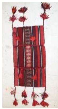
Figure (8): Kharj.