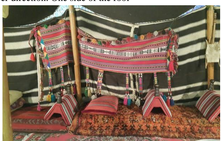
Figure (4): Besat (Runner).

Figure (5): A seating arrangement with a Zoleyah on the floor mattress, a Masnad (pillow), three (3) Shedads (camel saddles) to be used as arm resting cochins, and a wall hanging decoration.