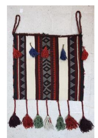
Figure (9): Adel.