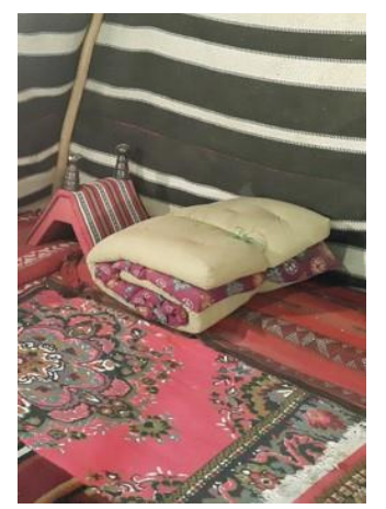
Figure (6): Firash (Mattress). Figure (7): Mezwadah.

Figure (5): A seating arrangement with a Zoleyah on the floor mattress, a Masnad (pillow), three (3) Shedads (camel saddles) to be used as arm resting cochins, and a wall hanging decoration.