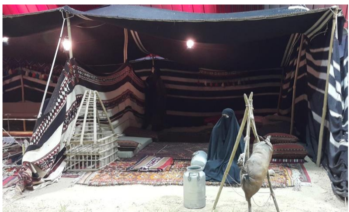
Figure (3): A tent divider "Qatta" is used in Bait-al-Sha'ar to separate the men's quarter from the women's quarter.