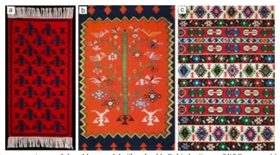
Fig. 1. Chiprovtsi carpets: a) one of the oldest models "karakachka"; b) the "tree of life" composition with geometric floral and birds figures; c) a detail of the model "kufarite" with complex composition, known from the ornamental period.

The traditional carpet ornamentations of the Chiprovtsi region are highly stylizing geometric forms which are symmetrically organized. The first ornamental shape which is determined by the technique of weaving is a triangle (Stankov, 1964). The motifs are closely interlocked, and although recognizable as various figures, they function simply as motifs in the pattern, in some cases structured by complex two-dimensional symmetries.